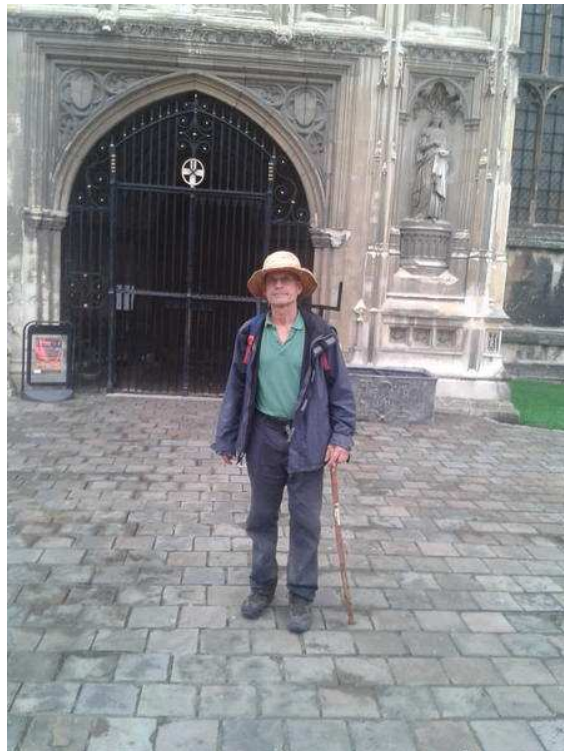
@ d finish, we went to give thanks. Canterbury cathedral. THANKS t al of u. Survived...signing off