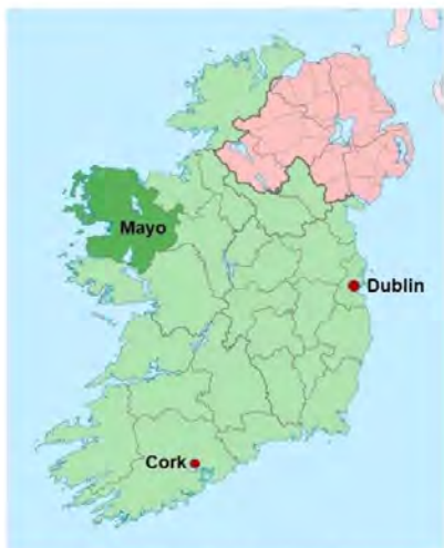
The island of Ireland, showing international border between Ireland and Northern Ireland, traditional provinces, traditional counties, and local authority areas in Ireland and Northern Ireland. Photo: Mabuska / Wikimedia Commons. License: CC ASA 3.0 Unp

Presenter: Are you happy to be back to Ireland?