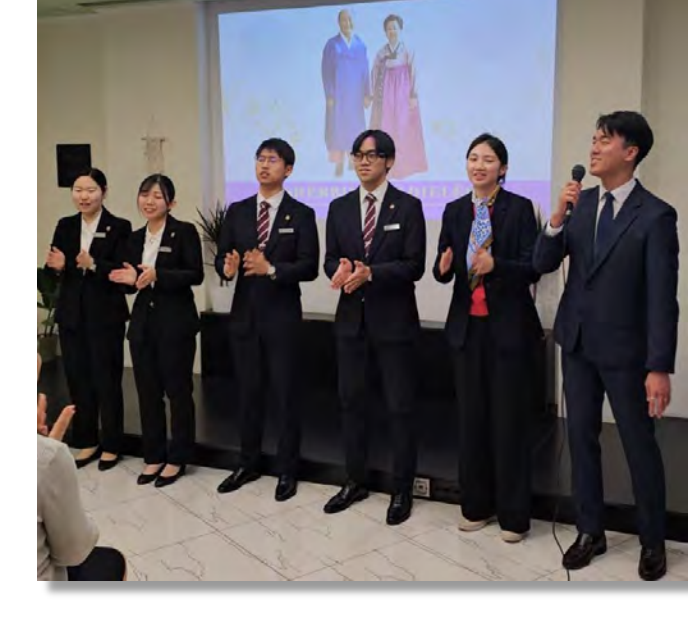
Attending Sunday Service