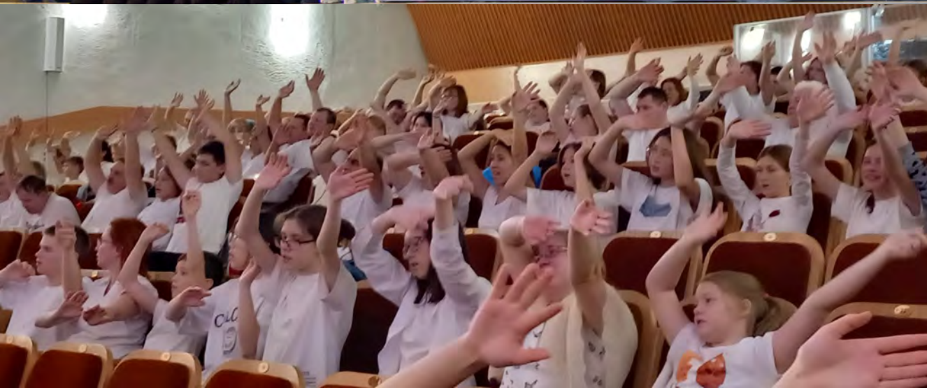
CheonBo Event in Yekaterinburg, Russia 2-3 December