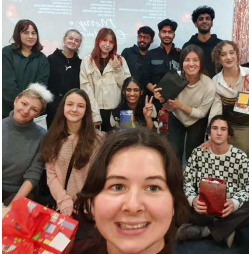
Fifteen participants, representing various cultures and nations, attended the YSP Christmas party, which included a “Secret Santa” activity and generated a joyful and youthful atmosphere.