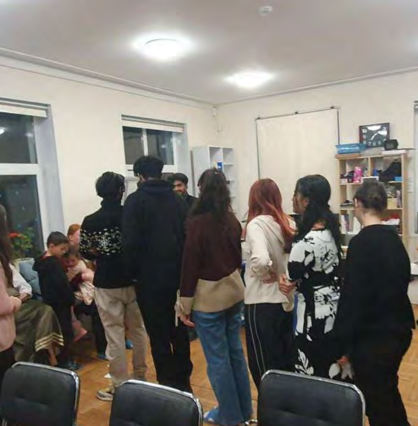
Activities in Moldova - YSP