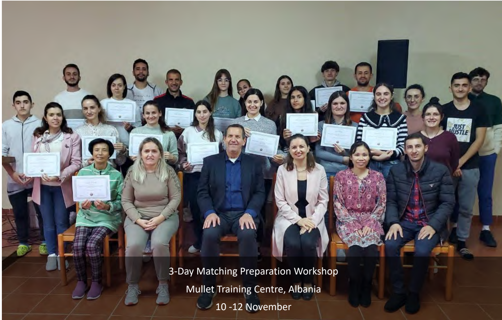
3-Day Matching Preparation Workshop Mullet Training Centre, Albania 10 -12 November