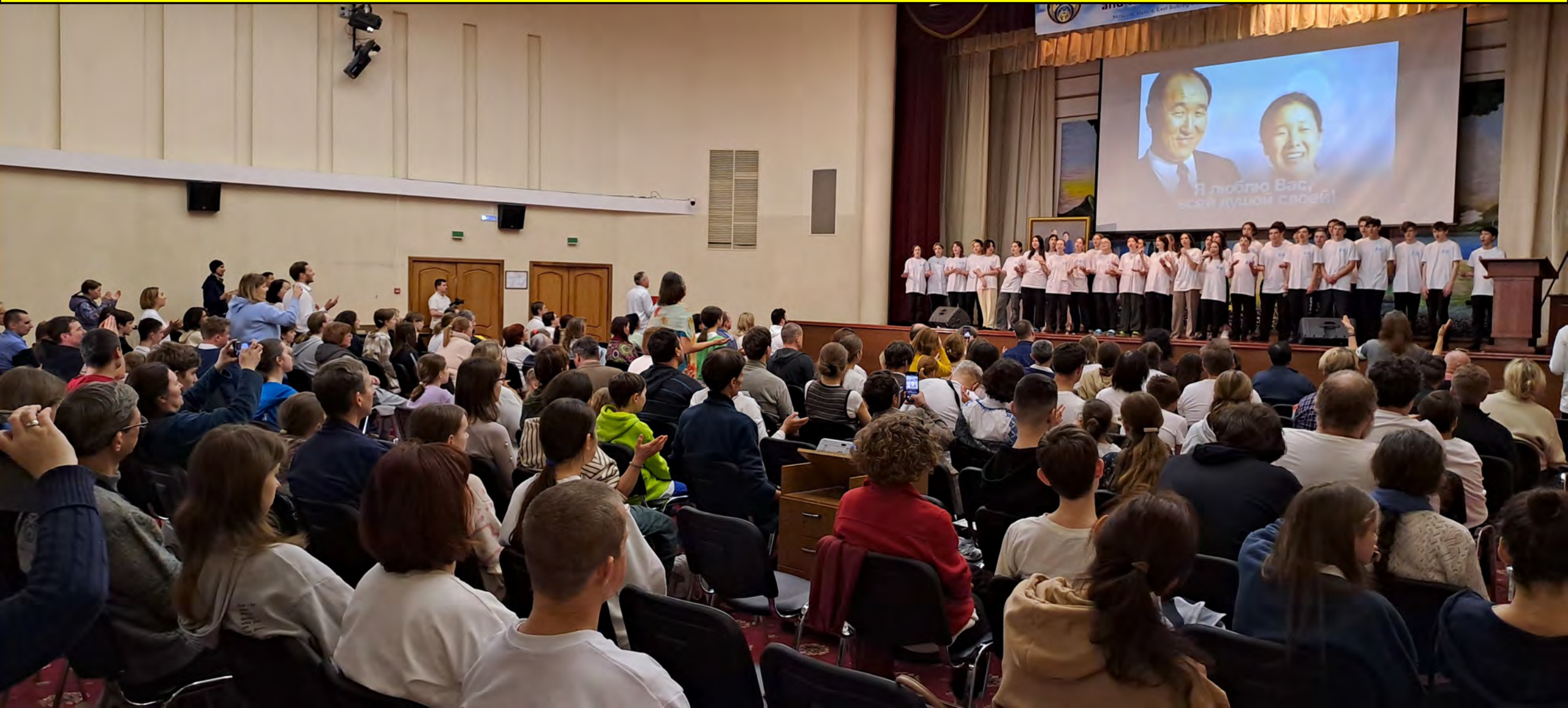
The 35-member Chanyang team close out the event with a final song.