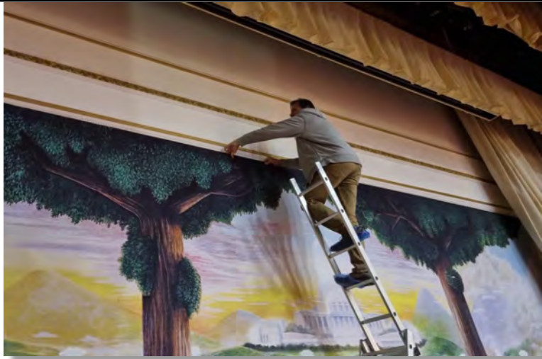
Hanging the backdrop