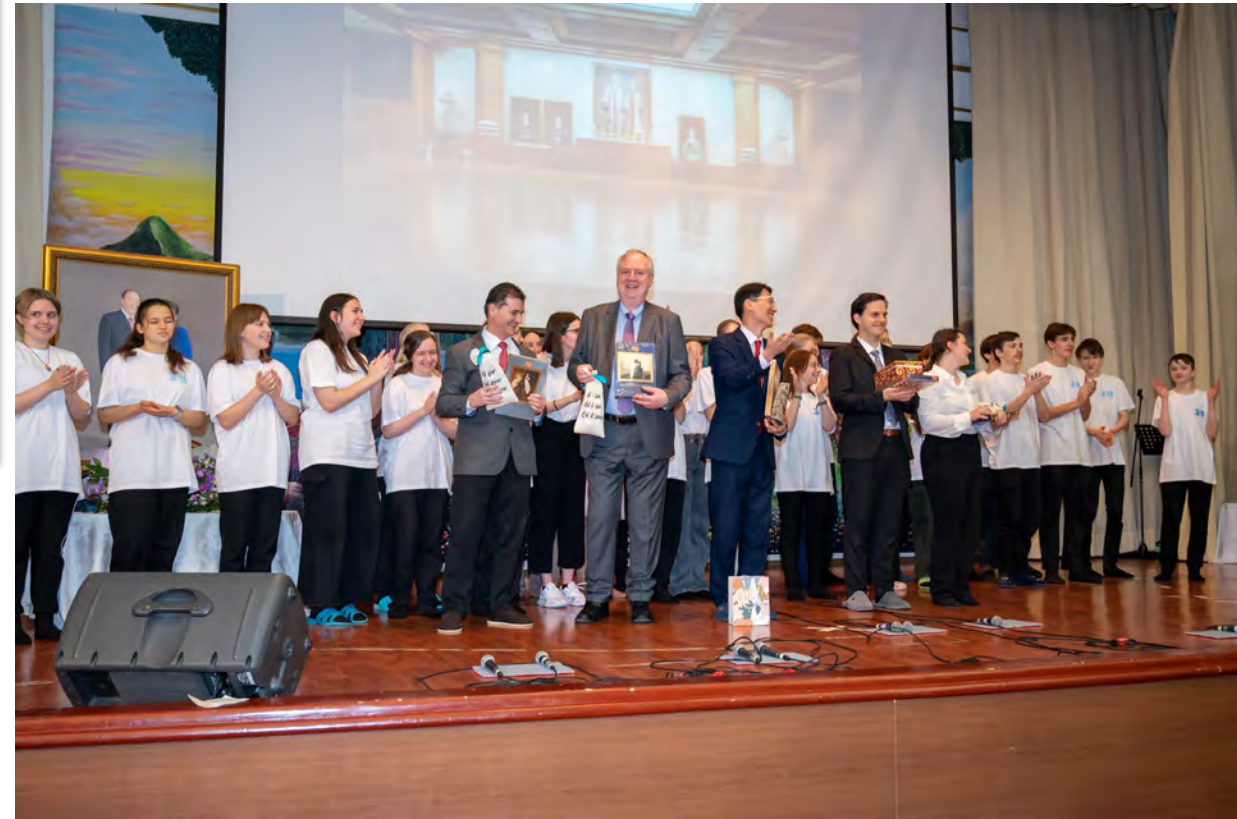
Entertainment and Victory Celebration