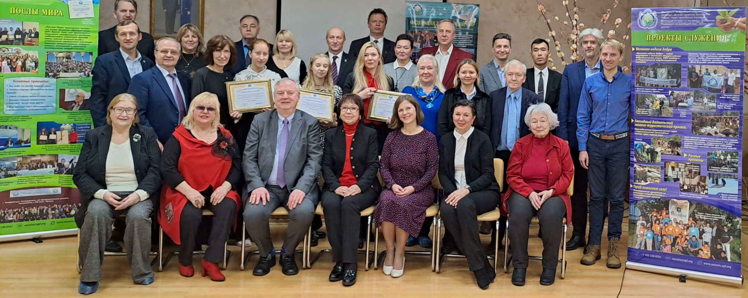
Meeting VIPs and Ambassadors for Peace