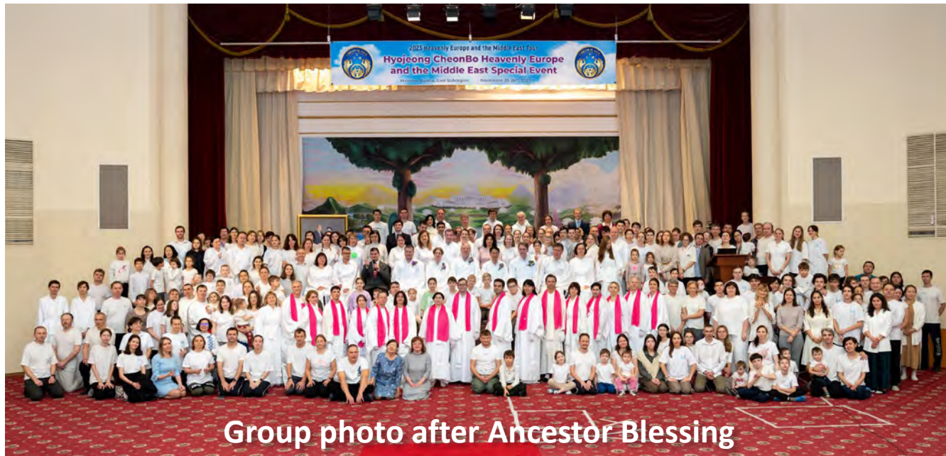
Group photo after Ancestor Blessing