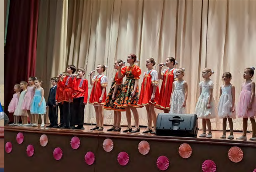
Angels of Peace and Moscow Church Choir