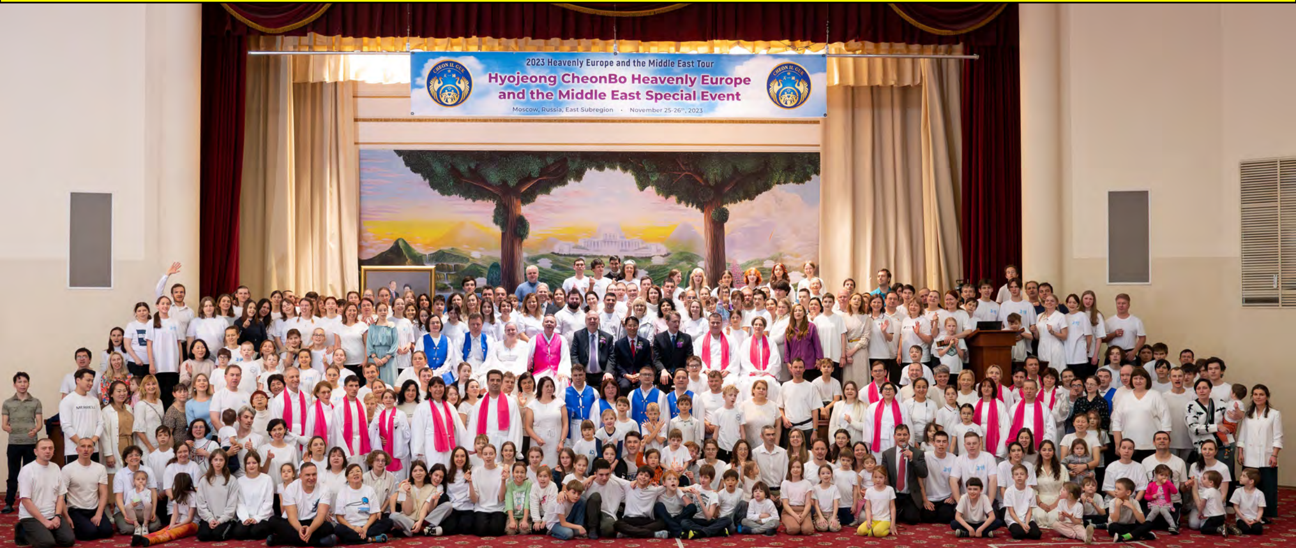
Group Photo after the HJOP Offering Ceremony