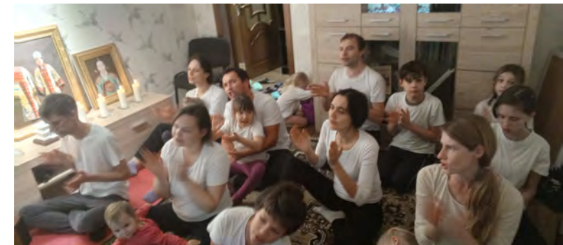
Online from Siberia