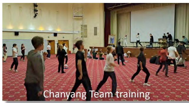
Chanyang Team training