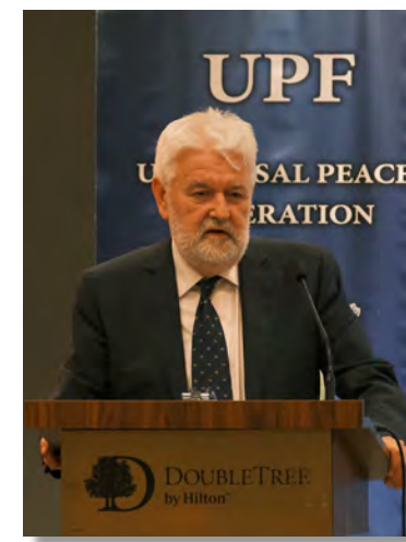
PM. Cvetkovic – Serbia