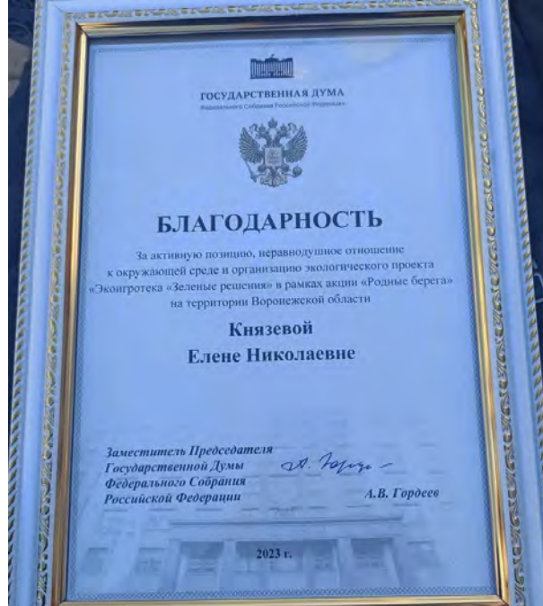
Certificate of Gratitude