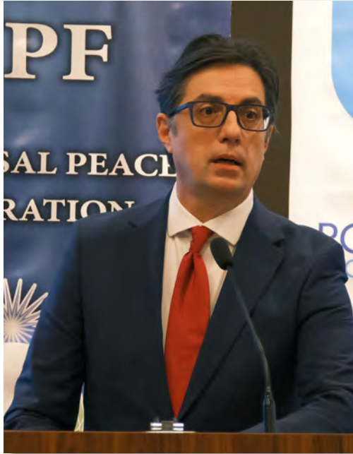
Pres. Pendarovski North Macedonia