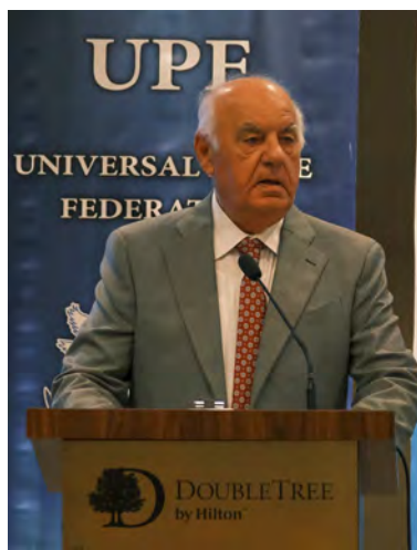
Pres. Moisiu – Albania