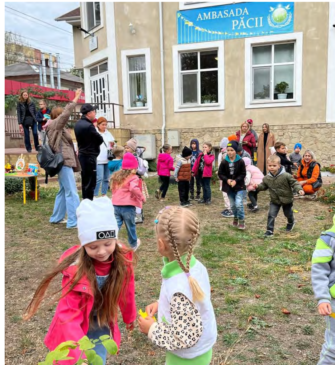
Refugee children in the grounds of the Peace Embassy