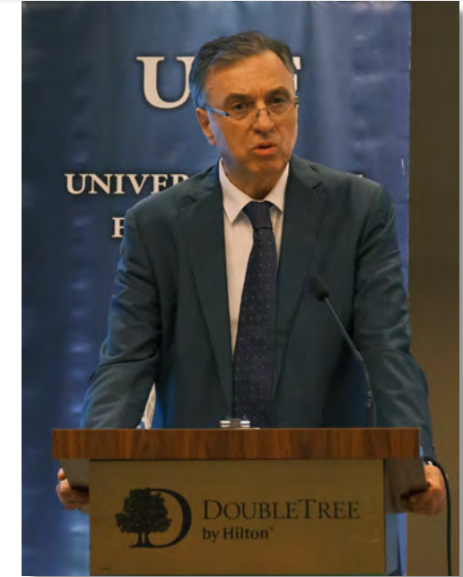
Pres. Vujanovic - Montenegro President, Podgorica Club