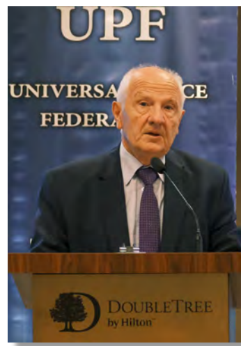
Pres. Sejdiu – Kosovo