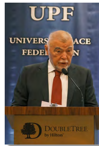
Pres. Mesic – Croatia