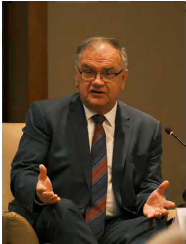
Pres. Ivanic – B&H