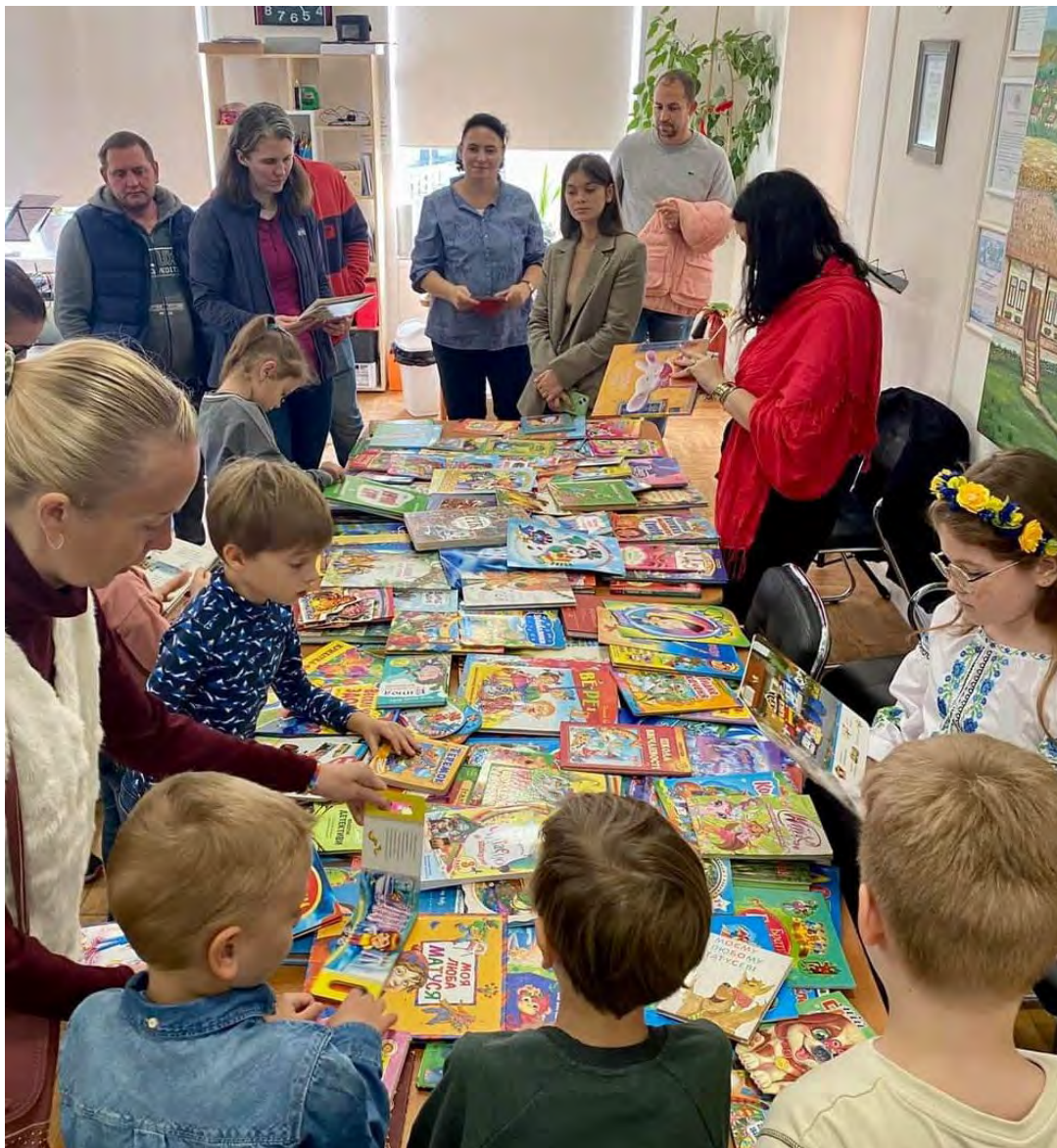
A gift of books from the Ukrainian Embassy