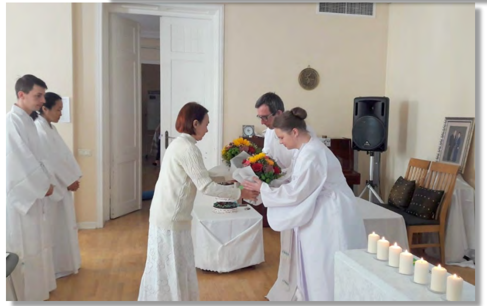
Thirty members, including Second Generation, took part in the second CheonBo Event at the Peace Embassy in Riga on 26 September.