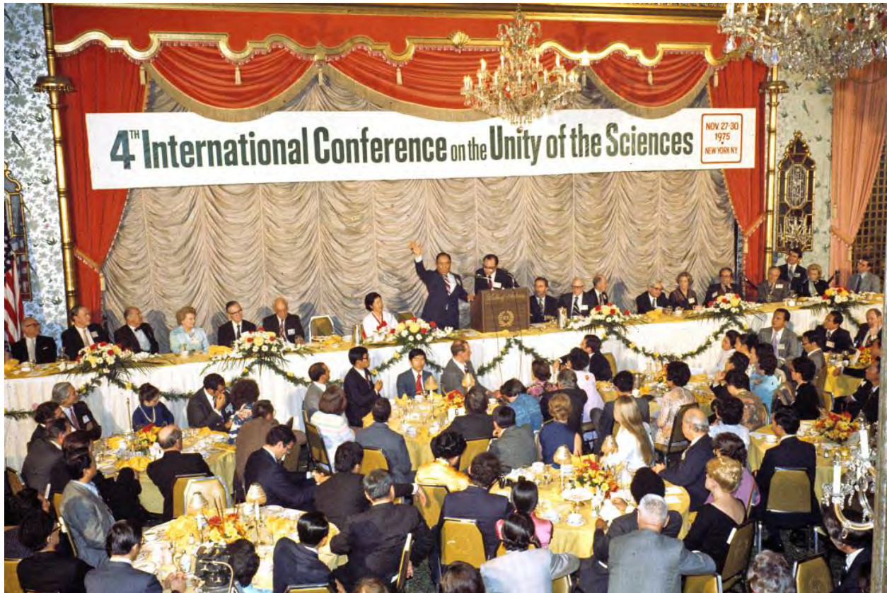
Rev. Sun Myung Moon gives the Founder's Address at the Fourth International Conference on the Unity of the Sciences on November 27, 1975 at the Waldorf-Astoria Hotel in New York.

way to demonstrate a unity of science and spirituality than a reliable machine to interact with spirit world. This would also have revitalized ICUS at a time Unification Thought was starting to be introduced. ICUS could have been a platform from which to transform the world.