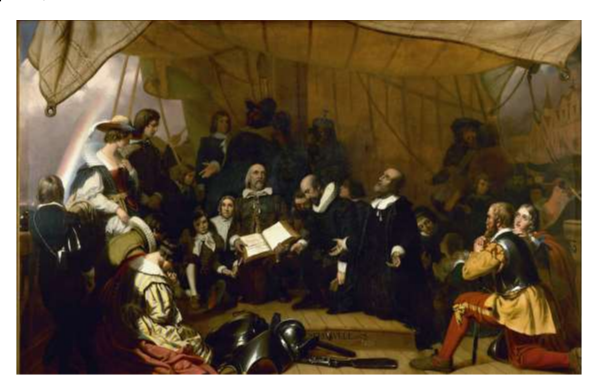
The Embarkation of the Pilgrims, a painting on the interior of the Capitol Rotunda