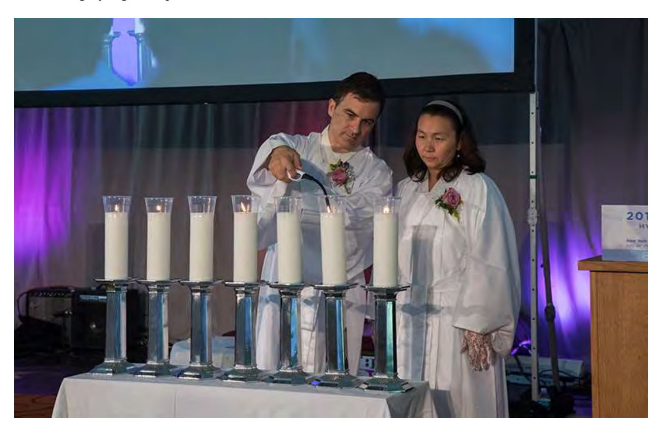
Reflections from Hyojeong Chung Pyung America Tour 2018 – Day 1 July 28, 2018, Tarrytown, NY

Everyone shared how grateful they are to True Mother for allowing this special grace by sending the team from Chung Pyung to help us liberate and bless our ancestors.