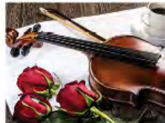
CLASSICAL MUSIC & DANCE