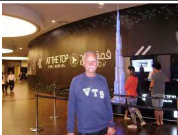
The author at the Burj Khalifa Tower in Dubai

and the Caucasus. Freed from Soviet domination, the almost 100 million Muslims of Central Asia remain shattered into six "republics," all firmly under Soviet-era nominally-Muslim dictators. In the eyes of most Muslims I met, Russia is an equal participant in the American-led crusade against Islam.