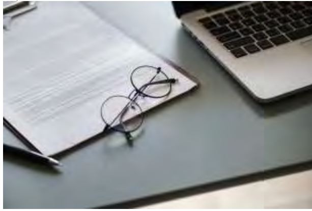
Healthy Minds Questionnaire

With this <u>anonymous questionnaire</u>, we are attempting to assess the extent and nature of mental health issues of adult members (18 years old and over) in two of Europe's largest faith communities (UK and Germany), so that we can work towards a better support system, offering advice and care to membership to improve awareness and wellbeing. Full details about the Healthy Minds project (including its main objectives and those involved) can be found on the project website: <u>www.uchealthyminds.com</u>.