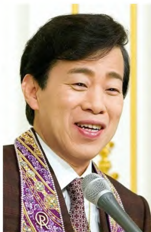
Master Ryuho Okawa speaking at Osaka Shoshinkan, Japan, 15th February 2015.

[Editor's note 2: Happy Science (幸福の科学, Kōfuku no Kagaku ) is a Japanese new religious movement founded in 1986 by Ryuho Okawa ((大川 隆法 – 1956–2023). It teaches that spiritual truth can be discovered through the study of universal laws governing happiness, personal growth, and the development of the soul. The movement's central concept is the pursuit of happiness through the principles of love, wisdom, self-reflection, and progress.