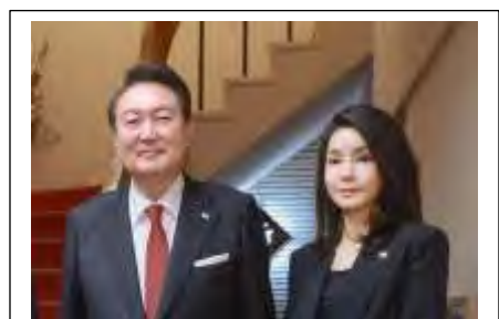
He was given life sentence, she 4 years in what some perceive as revenge on political opponents: Former South Korean President Yoon Suk-yeol and First Lady Kim Keon-hee, here in Tokyo March 16, 2023

The team of special prosecutors has rejected accusations of political bias. According to its explanation, Yoon's statements concerning Democratic Party politicians were recorded in an investigative report. However, the team concluded that those matters did not fall within the legal scope of the special prosecutors' mandate under the relevant legislation. Investigators therefore intended to transfer the information to other authorities for possible future action rather than pursue it themselves.