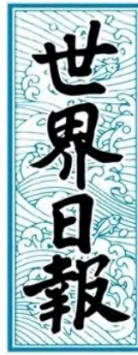
Logo of the Sekai Nippo

“What is abnormal about Japan's litigation of the former Unification Church is the introduction of the idea that something must be done about a