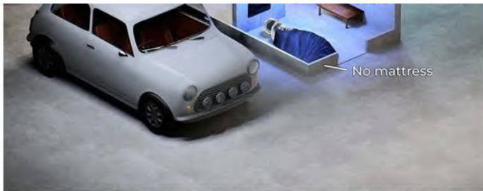
Layout of Mother Han's detention cell, compared to size of a Mini Cooper. Illustration: The Monarch Report

In South Korean criminal procedure, pre-trial detention can be extended in increments, subject to judicial review. Given the structured pace of hearings and the level of allegations, it is reasonable to anticipate that detention could continue at least through the primary evidentiary phase – that is, until mid-year – and potentially longer if the court determines that the risks of evidence tampering and flight outweigh the health risks posed by holding a frail octogenarian in poor health locked up in a tiny cell for a very long period.