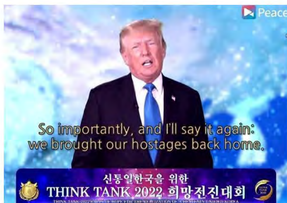
Donald Trump delivering his video message 12th Sep. 2021 at Rally of Hope held in Gapyeong, South Korea.

Another point of contention involved a 2021 event hosted by