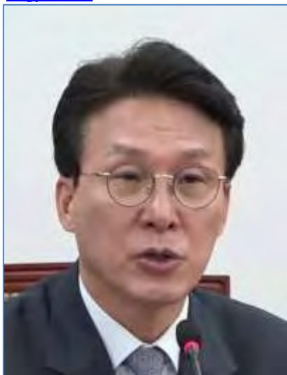
Kim Min-seok, Prime Minister of South Korea since July 4, 2025