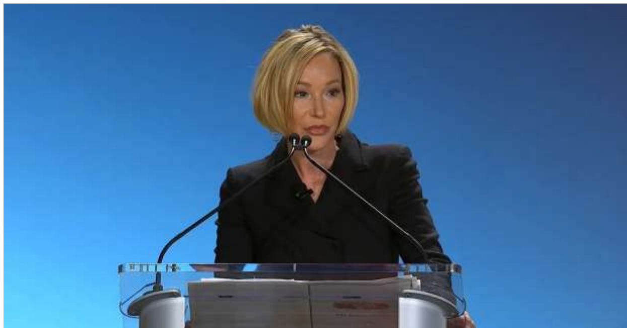
Paula White addressing the IRF Summit in Washington DC 2nd February 2026