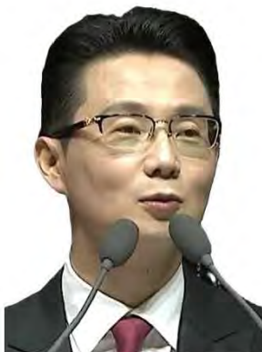
Yoon Yeong-ho, here 5th December 2021. Screenshot from live transmission from an international rally by FFWPU .

the conservative People Power Party (PPP) and the current governing Democratic Party of Korea (DPK) . Prosecutors allege that Family Federation funds were used to make unlawful political contributions, including so-called “split donations” – a tactic in which fairly large sums are broken into smaller amounts and distributed under multiple names to bypass legal limits and disclosure requirements. In addition, special prosecutors appointed by the Lee Jae-myung (이재명) administration accuse Mother Han of approving or directing the use of Unificationism funds to purchase expensive gifts for politically connected individuals.