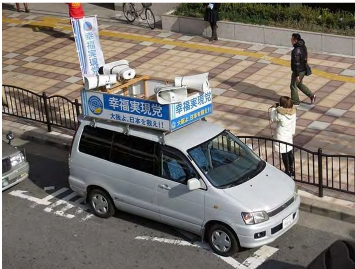
The Happiness Realization Party campaigning in Umeda, Osaka December 2, 2012