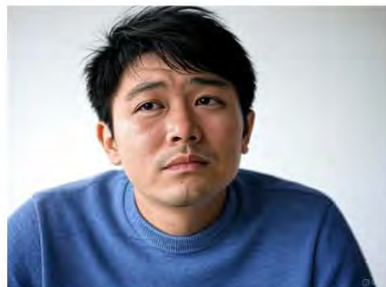
Frustrated young Japanese believer.