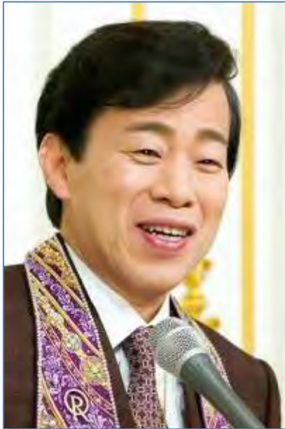
Master Ryuho Okawa speaking at Osaka Shoshinkan, Japan, February 15, 2015

The Happiness Realization Party (HRP) is a small Japanese political party founded in 2009 that is closely tied to the religious movement Happy Science (幸福の科学). It functions essentially as the political wing of that religious organization.