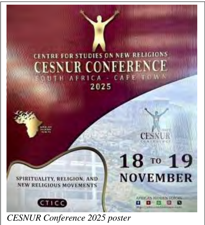
CESNUR Conference 2025 poster

A wake-up call to the free world: International solidarity needed against rising use of authoritarian tactics in democratic states against vulnerable minority faiths A Dangerous Precedent: Japan's Assault on Religious Freedom and Its Global Fallout - 2