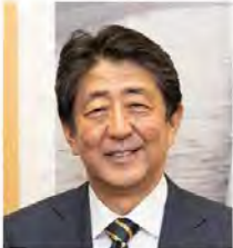
Shinzo Abe in March 2022, few months before he was assassinated.

The unfolding events involving the organisation commonly called the Unification Church – officially the Family Federation for World Peace and Unification (FFWPU) – have implications far beyond Tokyo’s courtrooms and the Japanese mainland. What happens in Japan may well reverberate around the world.