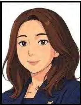
Kim Keon-hee Former First Lady