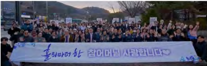
From a demonstration in support of Mother Han in Gapyeong, South Korea in November 2025.

Mother Han , now in her early eighties, has been detained since 22 nd September and was indicted on 10 th October by special prosecutors appointed by the current Lee administration for several alleged actions considered in breach of several South Korean laws. According to the Hankyoreh , prosecutors claim that she provided funds and valuable gifts to influential figures including First Lady Kim Keon-hee (김건희) and Rep. Kweon Seong-dong (권성동) of the People Power Party .