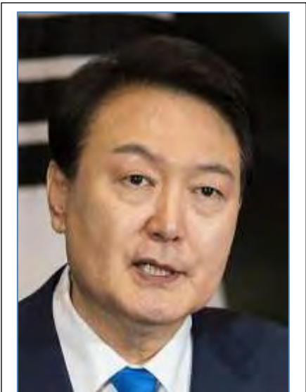
In same detention center as Mother Han : Former President Yoon Suk-yeol of the Republic of Korea April 25, 2023

① The first one is illegal or improper donations to a member of Congress.