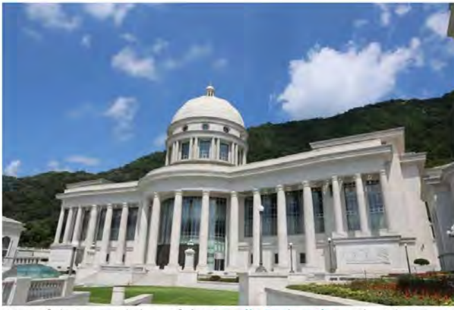
One of the sacred sites of the Family Federation – the Cheon Jeong Temple in Gapyeong, South Korea. The building houses a museum in honor of the life of the True Parents.

She invited the court to visit the Cheon Jeong Temple – her residence and an important symbolic site for the Family Federation in Gapyeong – to see firsthand how she has lived and what she has built. Her appeal was both a plea for understanding and an implicit challenge to the narrative that her actions were politically or materially motivated.