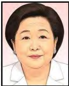
Hak Ja Han Religious leader