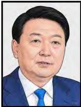
Yoon Suk-yeol Former President