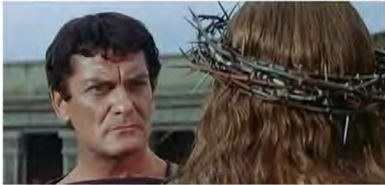
Scene from the Italian film Ponzio Pilato (1962).

It is the time to once again recall the essence of our Family Federation and remain faithful to that essence.