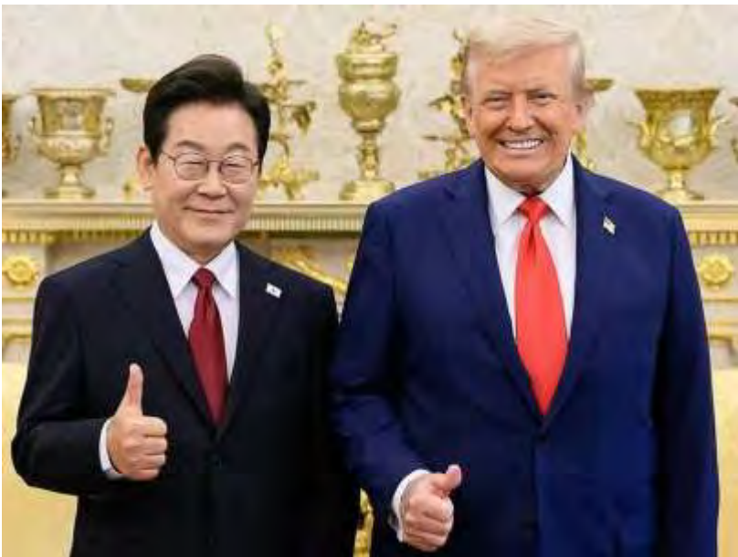
President Donald Trump hosts a bilateral meeting with President Lee Jae-myung of the Republic of Korea, Monday, August 25, 2025, in the Oval Office

"If separation of powers is a nuisance, President Lee should amend the constitution and simultaneously serve as president, Chief Justice of the Supreme Court, and leader of the Democratic Party. If you model it on China - where the state chairman, general secretary of the Communist Party, and chairman of the Central Military Commission hold overlapping posts - or North Korea - where the chairman of the State Affairs Commission, general secretary of the Workers' Party, and supreme commander of the people's army hold concurrent titles - it would match the world the Democratic Party dreams of. And both China and North Korea claim their systems are democracies."