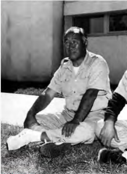
Father Moon in Danbury Correctional Facility, Connecticut, USA in December 1984.

“The suffering I endure is enough. Let everything be concluded within just one day of the investigation so that no more innocent people will suffer.”