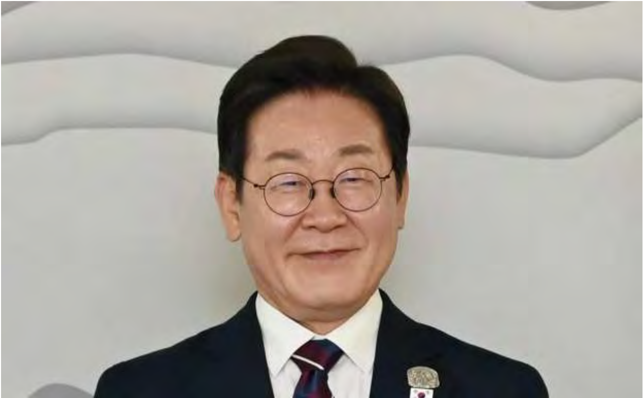
President Lee Jae-myung at a G-7 Summit June 17, 2025