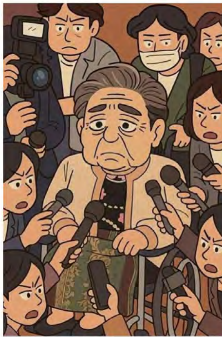
Hak Ja Han and aggressive reporters 17th Sep. 2025.

Hearing this, I felt so sorry and inadequate, seeing our helplessness in the face of a reality where the powerful suppress the innocent, simply because our foundation is so weak. If only our foundation had been as strong as that of Christianity, Catholicism, or Buddhism, would they then have dared to mock or belittle Heaven?