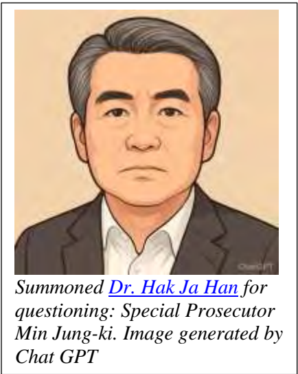
Summoned Dr. Hak Ja Han for questioning: Special Prosecutor Min Jung-ki.

[Editor's note: Min Jung-ki (also written Min Joong-ki, Korean: 민중기) is the special prosecutor appointed under President Lee Jae-myung (이재명) for the Kim Keon-hee (김건희) case. He is a former judge - specifically, he served as Chief Judge of the Seoul Central District Court (2018-2021) among other high-ranking judicial posts.