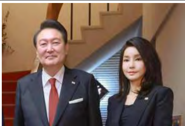
Imprisoned and investigated: Former South Korean President Yoon Suk-yeol and First Lady Kim Keon-hee, here in Tokyo March 16, 2023

Co-Founder Hak Ja Han (82) faces alarming arrest warrant amid health concerns as she is just recovering from heart operation