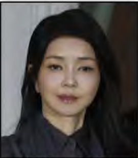
Involved in bribery scandal: Former South Korean First Lady Kim Keon-hee, here in Washington DC 10th July 2024. Cropped

And when asked again about delivering a necklace and bag to Mrs. Kim Keon-hee, she replied with confidence: “Why would I do such a thing?”