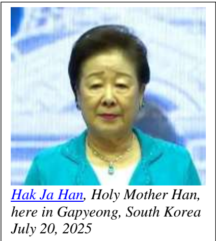
Hak Ja Han, Holy Mother Han, here in Gapyeong, South Korea July 20, 2025

It is important to understand that this is not a judgment of guilt. It is simply part of the legal procedure, designed to balance justice with fairness and personal liberty."