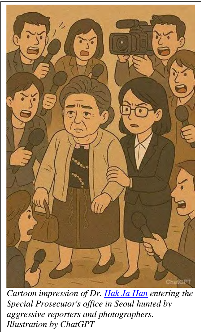
Cartoon impression of Dr. Hak Ja Han entering the Special Prosecutor's office in Seoul hunted by aggressive reporters and photographers.

"Why would I need to do that?" - Co-founder rejects allegations before prosecutors as she endures nine-hour inquiry despite fragile health