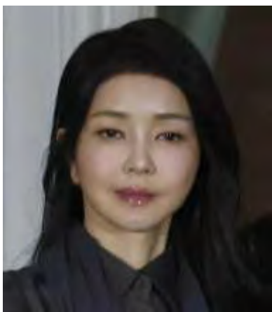
Involved in bribery scandal: Former South Korean First Lady Kim Keon-hee, here in Washington DC July 10, 2024

To "Did you directly order or approve any request?" she declared, "No."