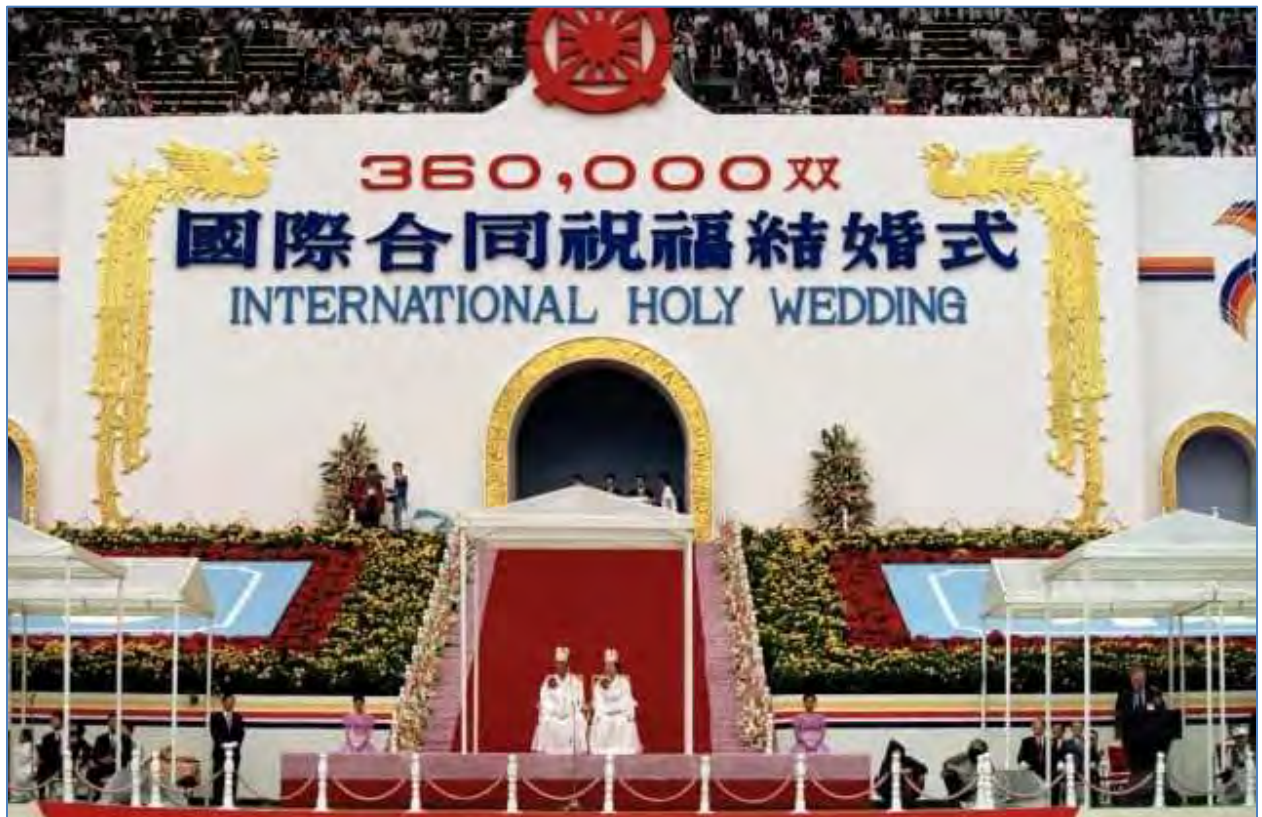
The stage with Father Moon and Mother Han August 25, 1995

The main event in the Blessing of all these couples from around the world took place in Seoul. Beginning with this Blessing event, a much larger proportion of the couples were already married beforehand and thus had their existing marriages blessed , rather than young unmarried people being matched and then receiving the Blessing .