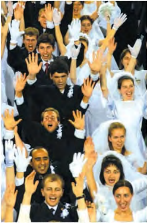
Some of the couples 13th July 2003 in Cheonan.

forward demonstrated by this ceremony is like a bright beacon of glorious light that will lead us to a world of peace and contentment and so fulfill the prophecies of all the great prophets.