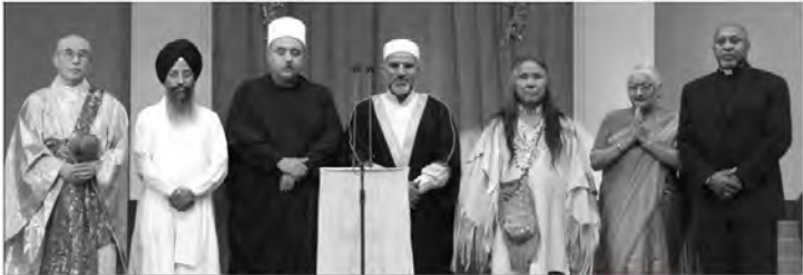
Religious leaders in Cheonan 13th July 2003.

The event showed the scope of the activities in which FFWPU has been involved, including those that aim to overcome the problems caused by sexual promiscuity and crises of sexual identity, which are threatening to families, nations and, moreover, world peace.”