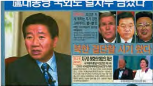
From the front page of August 2003 issue of Korean magazine Shisa News Monthly.

“The event showed how Rev. Moon actualized the unity of all different peoples through racial and religious