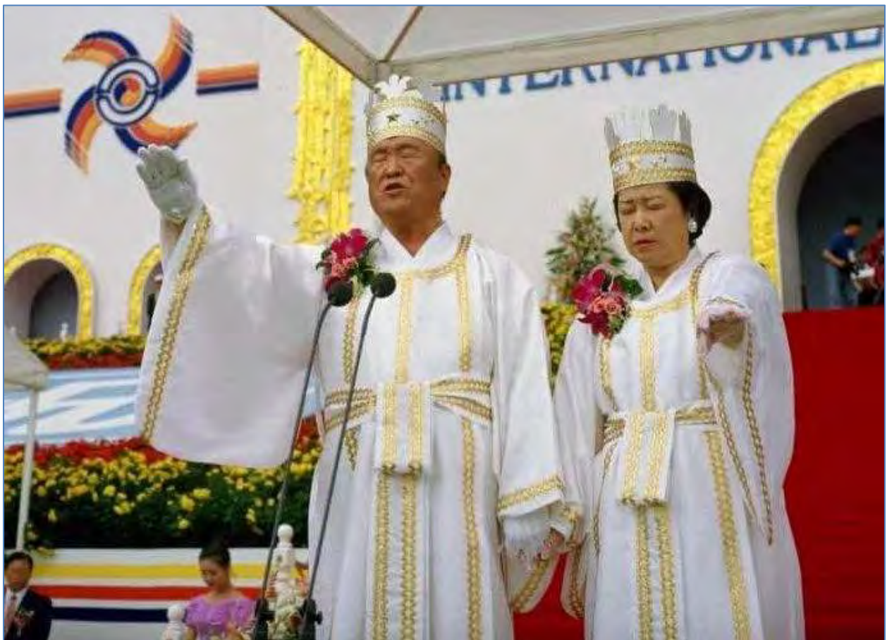
Father Moon and Mother Han praying for all the couples in Seoul's Olympic Stadium August 25, 1995

August 25, 1995 in Seoul's Olympic Stadium: Marking three decades since South Korea hosted one of the largest marriage blessings in history