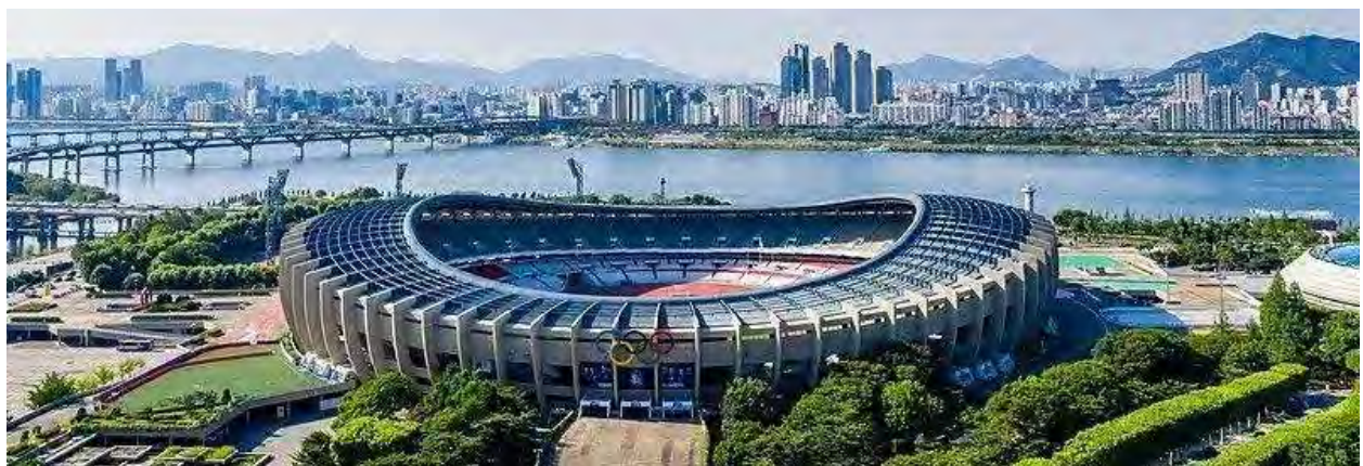
Seoul Olympic Stadium. Photo (2020)

The ceremony itself was at once majestic and deeply personal. Thousands of couples removed their pastel-colored raincoats, filling the arena with a sea of white and navy blue. A special orchestral prelude composed by Kevin Pickard set the tone of reverence, while the sprinkling of holy water by the True Parents and elder blessed couples marked a new beginning for each bride and groom. The resounding "YES" that thundered through the stadium as vows were proclaimed was echoed in living rooms, churches, and stadiums across the world. Fireworks, balloons, and cheers of manseis capped the day with jubilant energy, sending forth a vision of lasting hope.