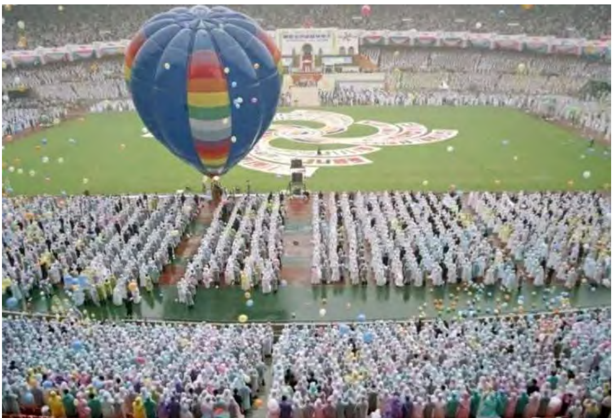
August 25, 1995 was a wet day in Seoul. Here, some of the couples with raincoat

The large number of couples who participated created significant practical challenges in many countries when it came to gathering the couples and blessing everyone simultaneously regardless of location. In Africa and in some countries of the former Soviet Union, the ceremony therefore had to be held at different times in many places.