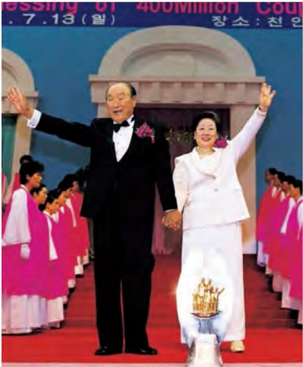
Father and Mother Moon 13th July 2003.

In his benediction prayer, Father Moon said,