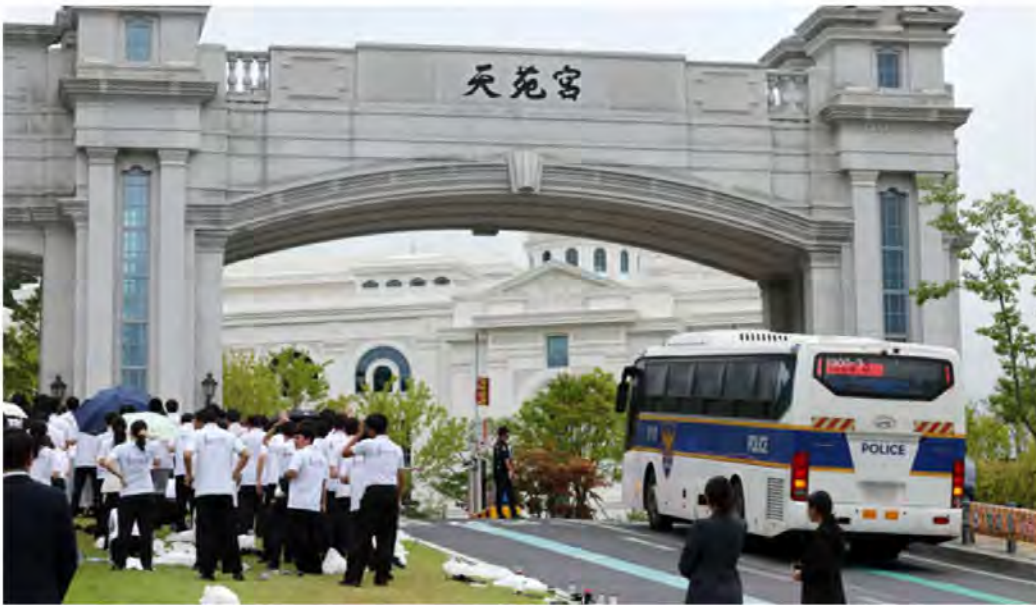
A police bus enters Cheonwon Palace in Gapyeong County, Gyeonggi Province, on the afternoon of July 18, the day the Minjunggi Special Prosecutor's Office began raiding the Unification Church.

Former Chief Yoon is suspected of requesting ▲ Official Development Assistance (ODA) for the Mekong River site in Cambodia ▲ Hosting the UN Fifth Secretariat in Korea ▲ Acquiring YTN ▲ Inviting the Presidential Inauguration ▲ Inviting the Deputy Prime Minister and Minister of Education to Unification Church international events in return for money.