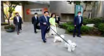
Yoon Seok-yeol and Kim Kun-hee's 11 pets are being cared for by Kim Kun-hee's associates...