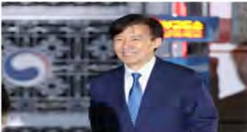
Former Cho Kuk, leader of the Cho Kuk Innovation Party, will be honored as a special envoy for Liberation Day at midnight on the 15th...