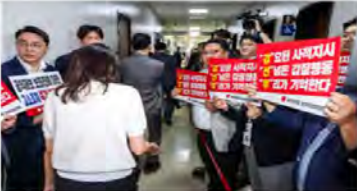
20 Current and Former Aides Explain the Myriad Abuses of Power by Lawmakers | "We..."