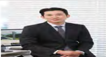
"A won-denominated stablecoin is the only way to secure Korea's value-added opportunity."