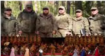
North Korea's troop deployment to Russia marks one year | North Korean soldiers' memo: "Preparing for war..."