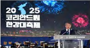
1,200 drones deployed along the Han River in Ttukseom, marking the start of the "2025 Korean Dream" campaign.