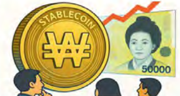
What is Lee Jae-myung's pledge for a "won stablecoin"? | "Korea..."