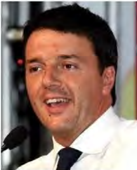
Matteo Renzi, Prime Minister of Italy 2014-2016. Cropped

The ruling also exposes the fragility of the factual claims made by AIVS. Among their most inflammatory accusations was the claim that Soka Gakkai secured its Intesa – a formal agreement with the Italian government granting legal recognition and access to public funds – through bribery involving former Prime Minister Matteo Renzi. The court found this allegation to be not only baseless but factually impossible, as the legislative process began before Renzi’s premiership and was supported across political lines, including by those hostile to his administration. This kind of unfounded claim is emblematic of the tactics used by some anti-cult actors who rely on innuendo and conspiracy rather than verifiable facts.