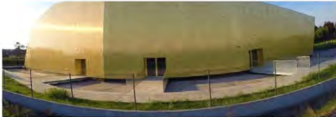
Corsico – Soka Gakkai Italian Buddhist Institute, the Italian branch of the Soka Gakkai International Nichiren Buddhist organisation.