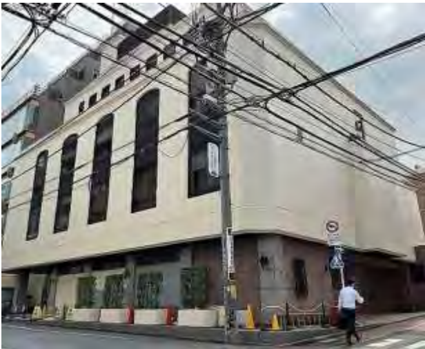
Tokyo headquarters of the Family Federation of Japan