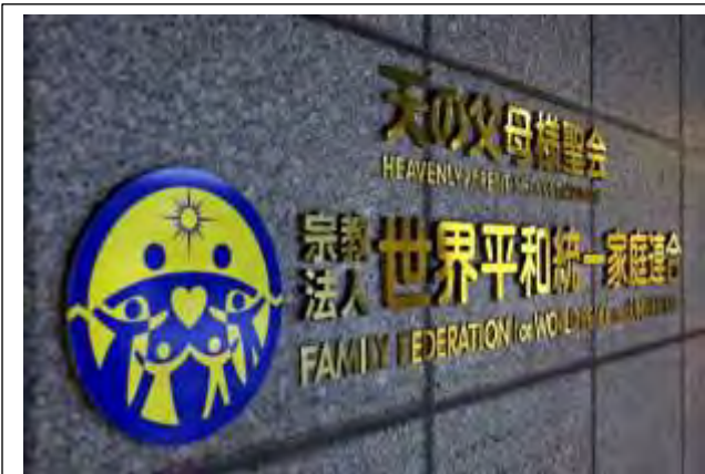
Sign at the entrance of the headquarters of the Family Federation of Japan in Shibuya, Tokyo

See also Church Assets: Lawyers Move to "Seize Them All"