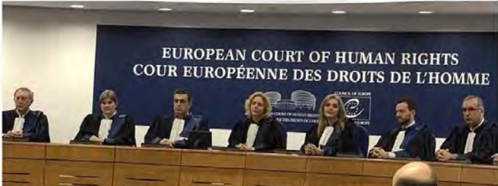
From the opening of the judicial year 1st May 2021 at the European Court of Human Rights.

At the heart of this case lies a profound and often overlooked issue: the power of language to marginalize, stigmatize, and criminalize peaceful belief systems. The court specifically found that the repeated use of the term seta – the Italian equivalent of “cult,” with strong pejorative implications – to describe Soka Gakkai was not only inappropriate but inherently defamatory.