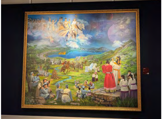
Pilgrimages - Deepening the Connection

Many members also took part in meaningful pilgrimages throughout the week, visiting holy sites like Cheon Won Gung, the DMZ, Seodaemun Prison, and historical places like Chongpadong in Seoul. These visits deepened the understanding of Korea's role in providence and allowed members to connect with the heart of our movement in profound ways.