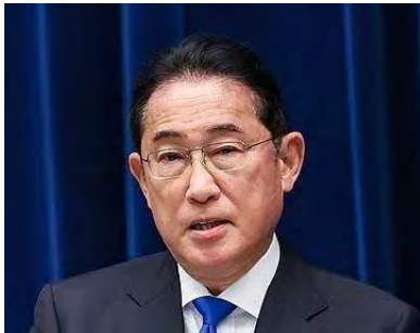
Made a 180-degree flip-flop, changing the law overnight: Former Prime Minister Fumio Kishida. Here, at press conference August 14, 2024

This question should pop into the mind of any casual Japanese observer since it is widely known that only two religious organizations in Japan have ever been dissolved. Both were based on criminal - not civil - convictions.