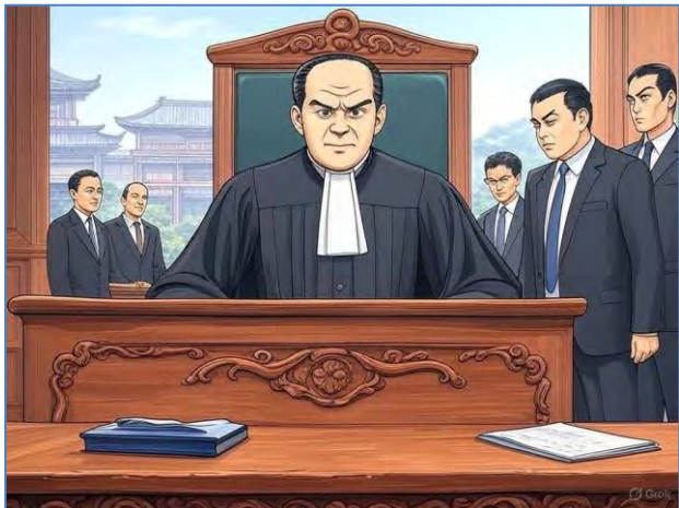
Japanese state waging lawfare against religious minority