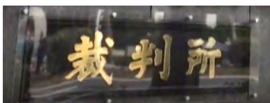
Courts used for lawfare? Here, sign outside Tokyo District Court

and given precedence over a signed international treaty, thereby putting Japan in a precarious position where it betrays its international obligations. This exonerating evidence was entirely ignored in the Japanese court's judgment of March 25 .