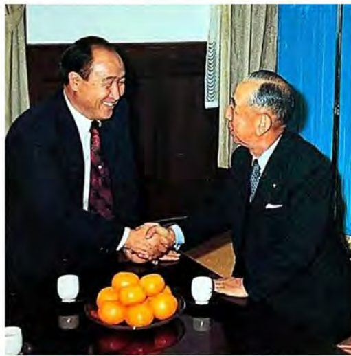
Sun Myung Moon and Nobusuke Kishi, Prime Minister of Japan 1957-1960, shaking hands in Tokyo.

In 1973, with Mrs. Moon by his side, Rev. Moon met former Japanese Prime Minister Nobusuke Kishi (岸信介元), the grandfather of Shinzo Abe (安倍晋三). Moon and Kishi were allies in fighting communism and created a friendship that lasted generations.