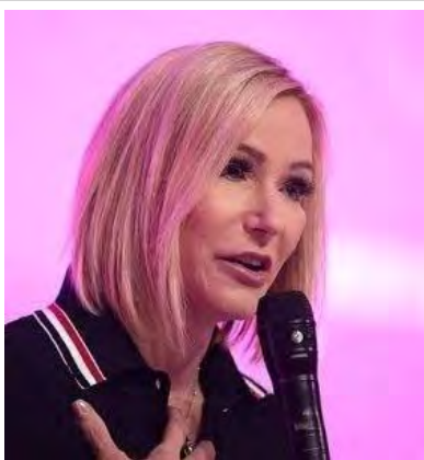
Rev. Paula White, here June 11, 2021 in Grapevine, Texas