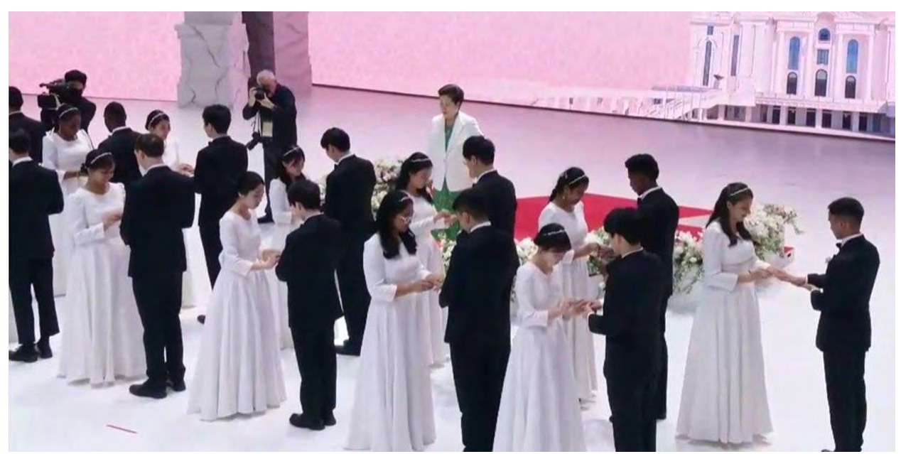
The exchange of <u>Marriage Blessing</u> rings April 12, 2025

<u>Mother Han</u> entered the stage through two lines of "attendants" - couples who had their marriage <u>blessed</u> by her between 2013 and 2024. She began what is called a "<u>Marriage Blessing</u> ceremony" by sprinkling holy water on 13 representative couples in two lines on stage. At the same time, assistants sprinkled holy water on all the couples below the stage and at <u>blessing</u> venues worldwide.