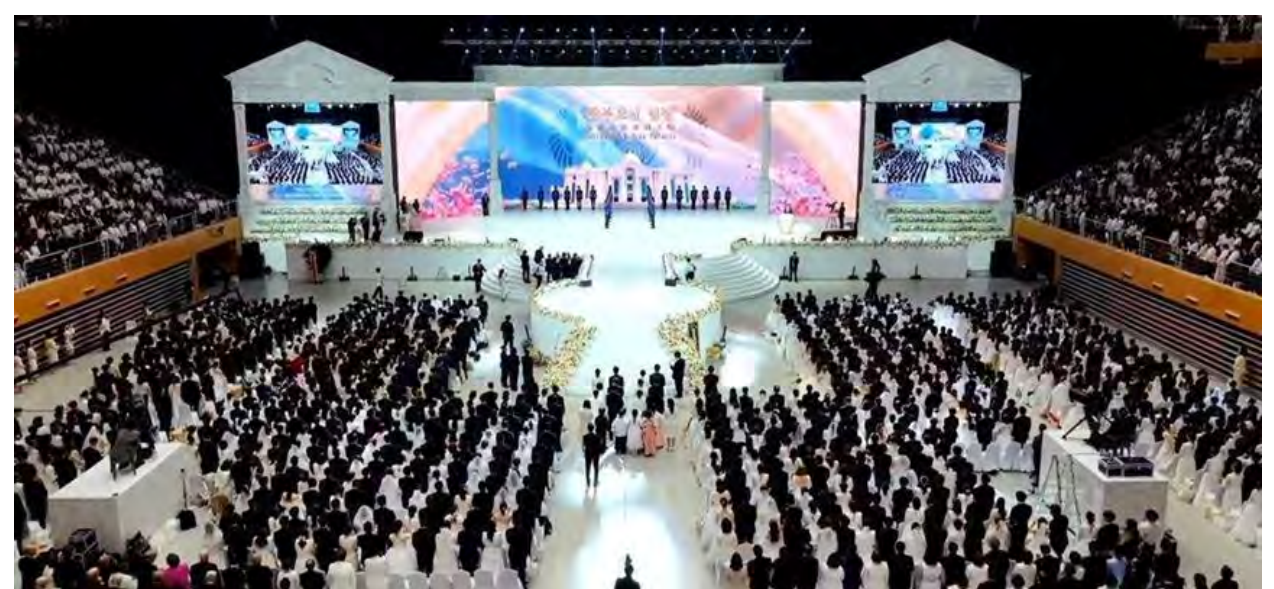
From the <u>Marriage Blessing</u> ceremony in Gapyeong, South Korea April 12, 2025

"I hereby proclaim that the virtuous men and women participating in this 'cosmic' <u>blessing</u> ceremony officiated by the 'True Parents of heaven, earth, and humankind' [See editor's note below] have been joined in holy matrimony before heaven and earth through the grace of Heavenly Parent (<u>God</u>) and the 'True Parents of heaven, earth and humankind'." (from simultaneous translatuion)