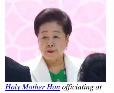
the <u>Marriage Blessing</u> ceremony April 12, 2025

Family Federation hosts massive international Blessing ceremony in South Korea with thousands wed - 5,000 couples