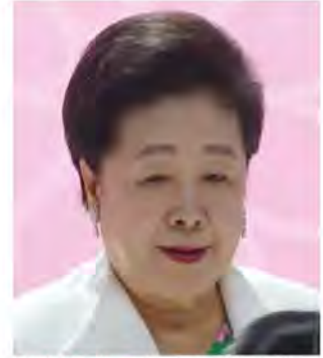
Hak Ja Han 12th April 2025.