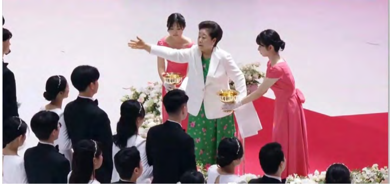
Hak Ja Han, Holy Mother Han, sprinkling holy water on representative couples April 12, 2024

Family Federation hosts massive international Blessing ceremony in South Korea with thousands wed - 5,000 couples