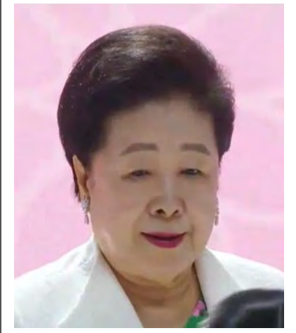
<u>Hak Ja Han</u> April 12, 2025

True Parents of Heaven, Earth, and Humankind" [See editor's note below] was held on 12th April at the Cheongshim Peace World Center in Gapyeong County, Gyeonggi Province, South Korea. According to the organizers, 5,000 couples from 90 countries participated. About 30,000 people - also according to organizers - gathered at the venue, and the ceremony was broadcast worldwide via internet streaming and other media.