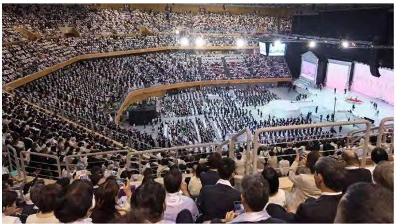
"Marriage Blessing Ceremony" April 12, 2025, at the Cheongshim Peace World Center in South Korea

A Japanese woman who married an American man said happily,