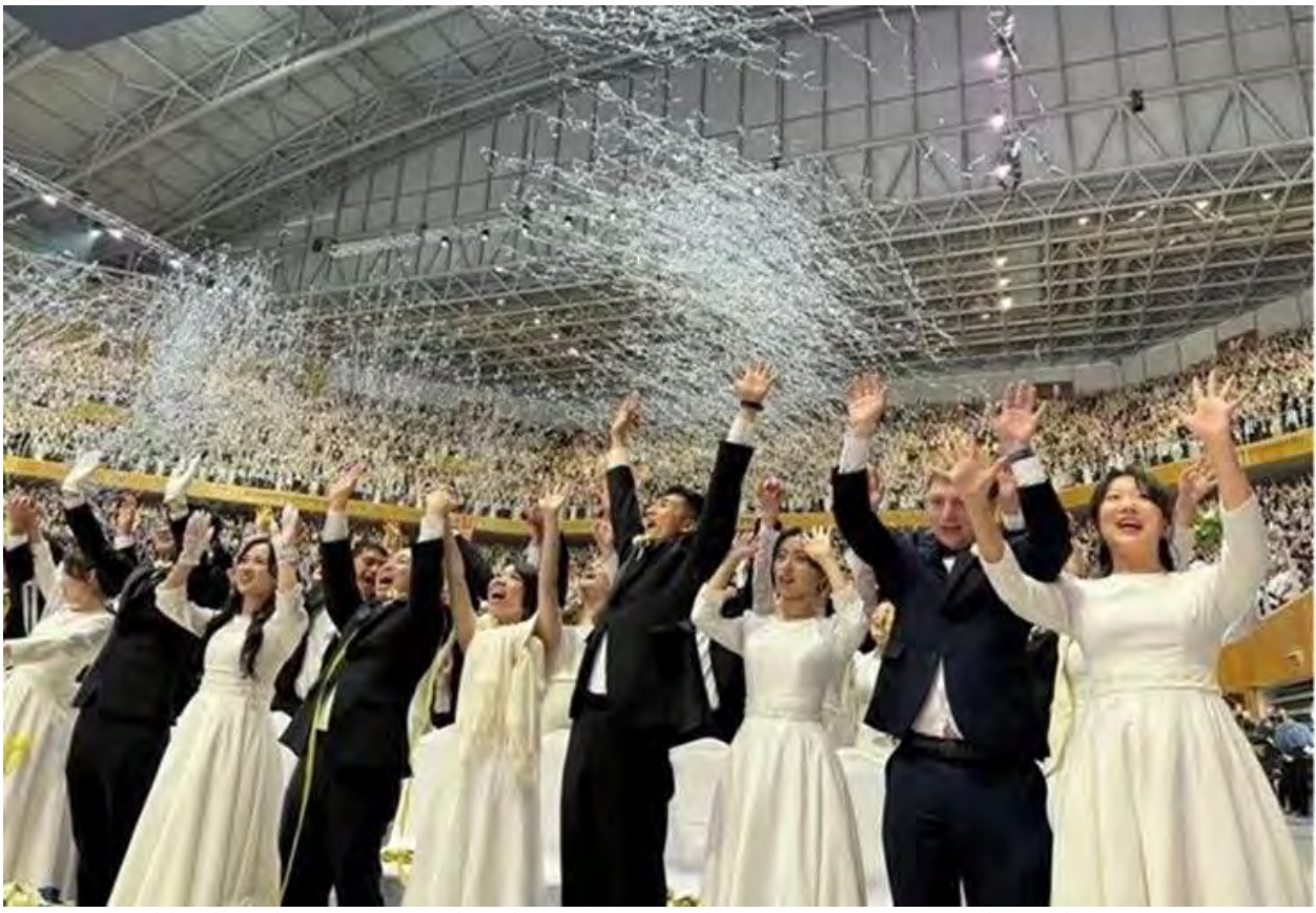
Grooms and brides who participated in the "<u>Marriage Blessing</u> Ceremony" 12th April 2025, at the Cheongshim Peace World Center in South Korea