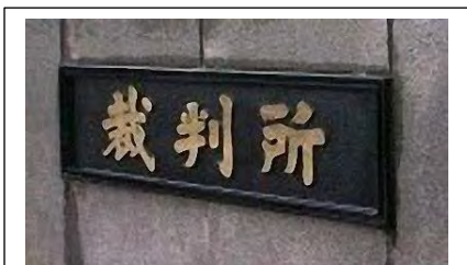
Court issuing controversial verdict. Here, the sign outside Tokyo District Court