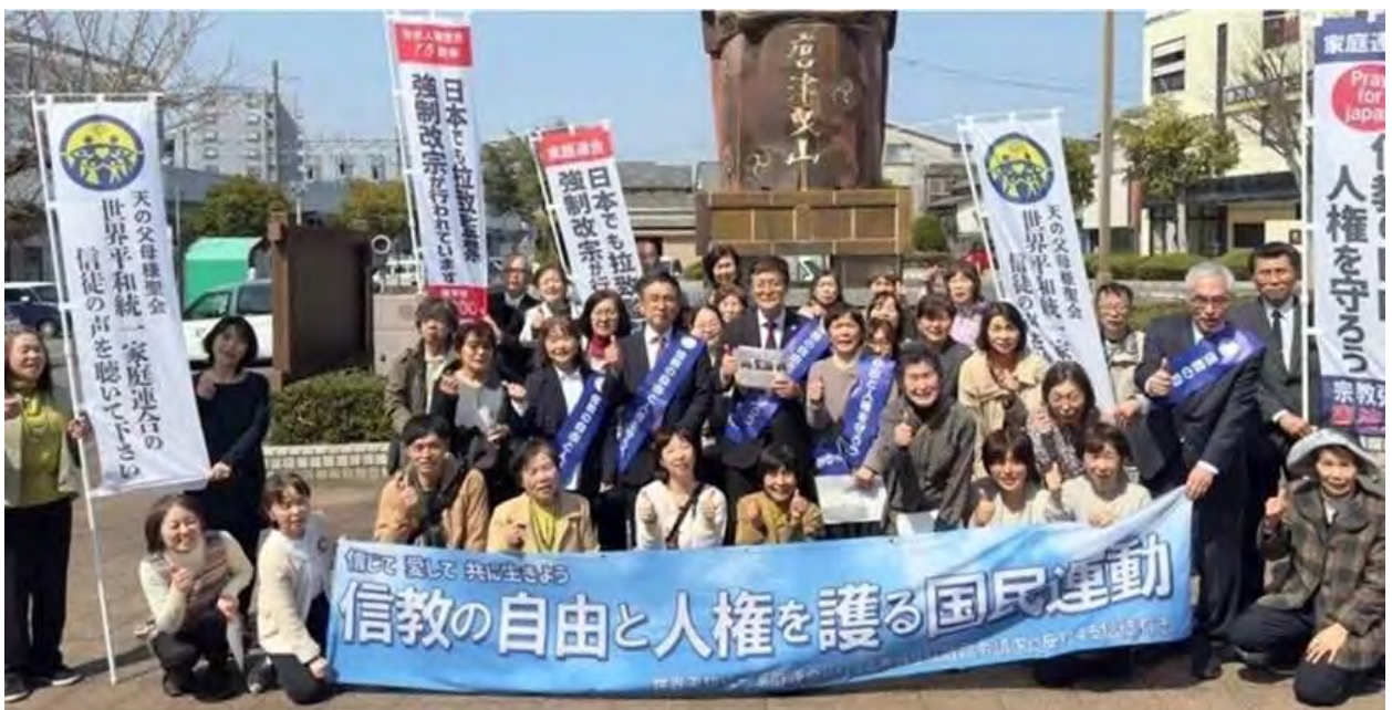
Demonstration against unjust and xenophobic verdict against the Family Federation in Japan. Here members in Karatsu City on the southern island of Kyushu protesting March 30, 2025

The ruling , if upheld on appeal, could lead to the dissolution of the Family Federation as a legal entity in Japan. Such a consequence would potentially allow the government to seize a large number of properties held by the religious organization and confiscate donations made by everyday members, raising deep concerns about the future of religious freedom in the country.