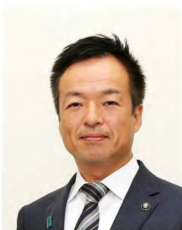
Shintaro Maeda (前田 晋太郎), Mayor of Shimonoseki, Yamaguchi Prefecture, Japan.

Facility ban sparks religious freedom concerns as Japanese city enforces dissolution order despite ongoing appeal