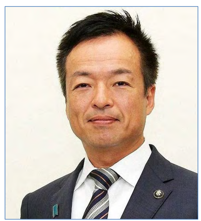
Shintaro Maeda, Mayor of Shimonoseki, Yamaguchi Prefecture, Japan

Facility ban sparks religious freedom concerns as Japanese city enforces dissolution order despite ongoing appeal