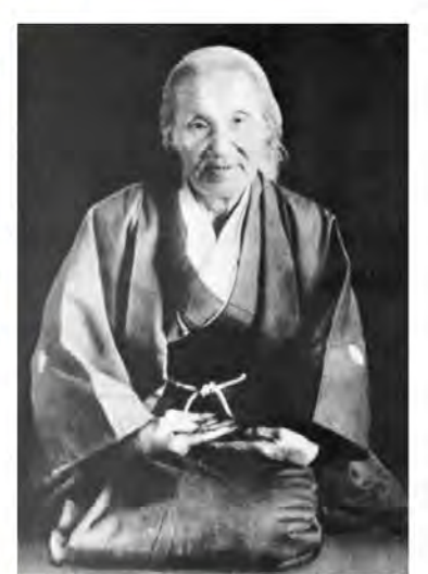
Nao Deguchi (出口なお) in 1916. Photo: Wikimedia Commons. Public domain image

Omotokyo emphasizes universal salvation, spiritual purification, and the ultimate unity of all religions. The religion stresses the importance of living in harmony with divine will and nature.