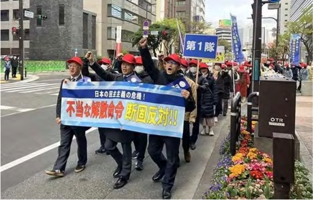
Demonstration in Fukuoka, Japan 30th March 2025.