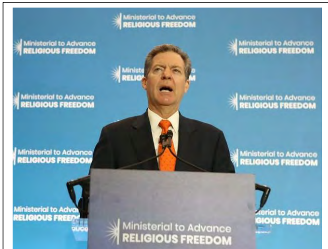
Ambassador at Large for Religious Freedom Sam Brownback delivers opening remarks at the Ministerial to Advance Religious Freedom held at the U.S. Department of State in Washington D.C. on July 16-18, 2019

oppression through his faith is not an option.