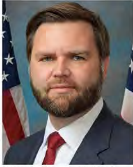
Senator Vance official portrait. 118th Congress, 26th Jan. 2023.

Senator J.D. Vance, whom Trump selected as his running mate, is a devout Catholic. During an October campaign rally, when someone in the crowd shouted, "Jesus is King," Vance responded, "That's right. Jesus is King," earning thunderous applause. His comment was also a jab at Democratic candidate Vice President Kamala Harris, who, days earlier, had dismissed a Christian student declaring, "Jesus is Lord," by saying, "You're at the wrong rally."