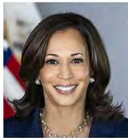
Vice President Kamala Harris takes her official portrait Thursday, March 4, 2021, in the South Court Auditorium in the Eisenhower Executive Office Building at the White House.

In late October, Harris attended a worship service at a black church in Philadelphia, Pennsylvania, a key battleground state. She shared her childhood experiences of attending church and emphasized how those experiences helped her "fully understand the teachings of the Bible and the power of faith." Naturally, no one derided her actions as "too close" to religion.