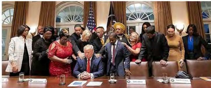
President Donald J. Trump participates in a prayer with African American Leaders and Pastor Paula White Thursday, Feb. 27, 2020, in the Cabinet Room of the White House.

In late October 2024, just days before the U.S. presidential election, a gathering in the Atlanta suburbs of the key battleground state of Georgia attracted over 1,000 Christian pastors supporting Republican candidate and former President Donald Trump.