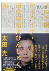
The front page cover of "Geinin Ningyo: Corona Pandemic, Ukraine, and Election Special - The Great Displeasure Edition" by Hikari Ota, published on Asahi Shimbun Publishing.

However, even though the full picture of the assassination of former Prime Minister Shinzo Abe (安倍晋三) remains unclear, the media jumped on the leaked information from the investigative authorities that there was a grudge against a religious organization. The media heated up the reporting based on the premise that this was the motive for the crime.