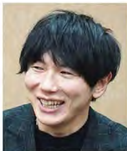
Noritoshi Furuichi.

Two days after the attack on the Prime Minister, sociologist Noritoshi Furuichi (古市憲寿) shared a similar perspective on the morning show "Mezamashi 8" (Fuji TV).