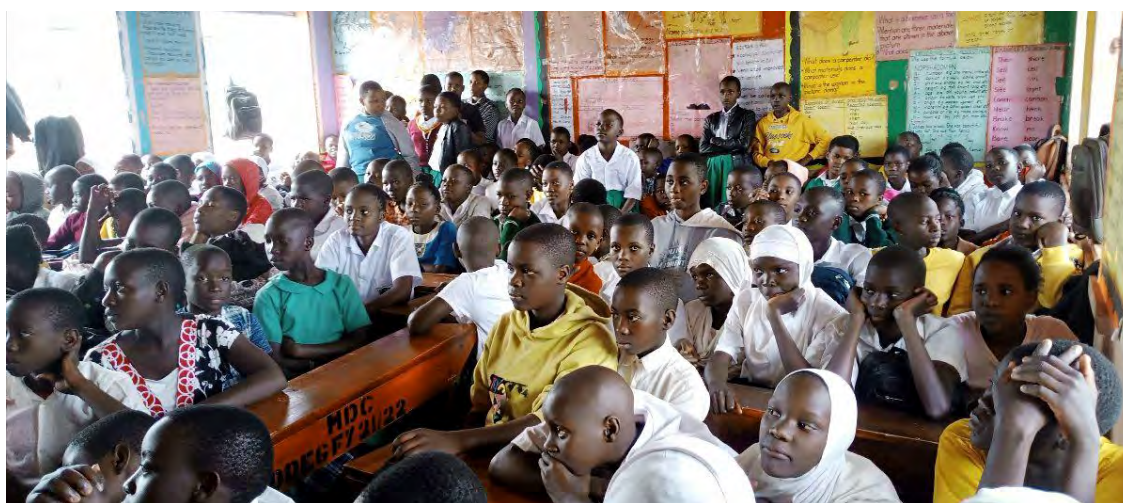
Students at Busabala Primary School, Uganda.

Since she began this support last year, the school dropout rate, especially for girls, has reduced tremendously. Likewise, the number of girls attending school has overtaken that of boys.