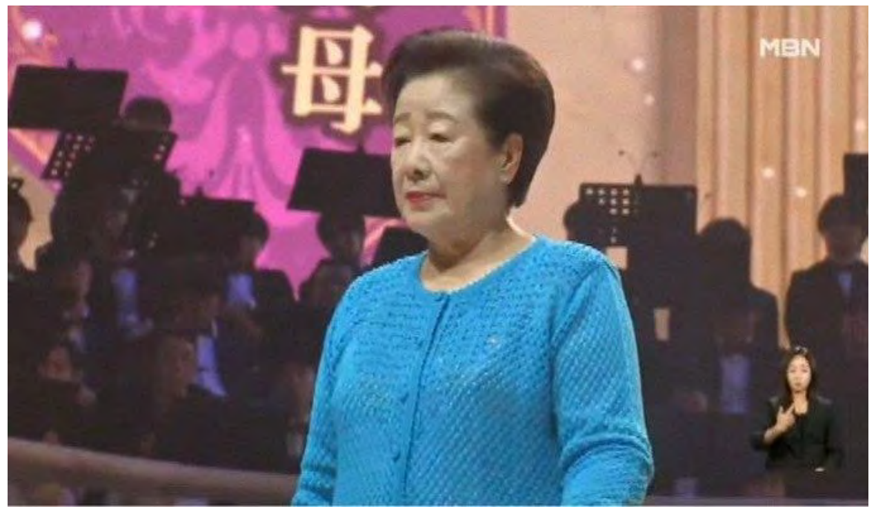
From news on South Korean cable TV channel MBN 24th April 2024 featuring Mother Moon

Large wedding receives large media coverage as news channels eye solution to collapsing birth rates