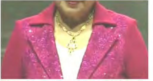
Mother Moon at the celebration 24th April 2024.

In 2020, Mother Moon, Hak Ja Han, designated this anniversary as the most important Holy Day of the Family Federation. From 2021, two more of the movement's Holy Days have been celebrated together with the anniversary.