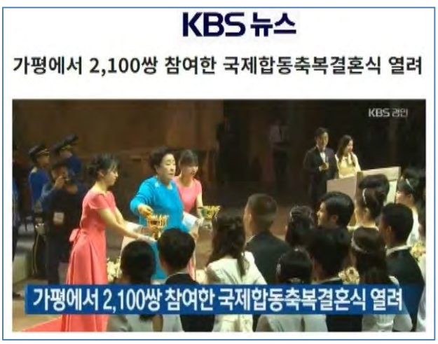
KBS News reporting on large wedding 24th Apr. 2024

The <u>wedding of 2100 couples</u> was featured in the news broadcasts of big TV networks like KBS and SBS. Also, YTN, the biggest news wire service in Korea, reported on it together with the major cable networks Channel A, TV Chosun and MBN.