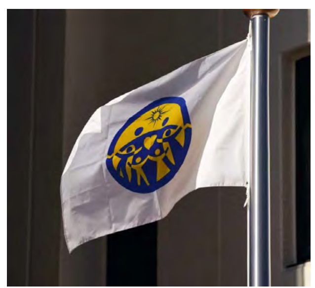
The flag of the Family Federation