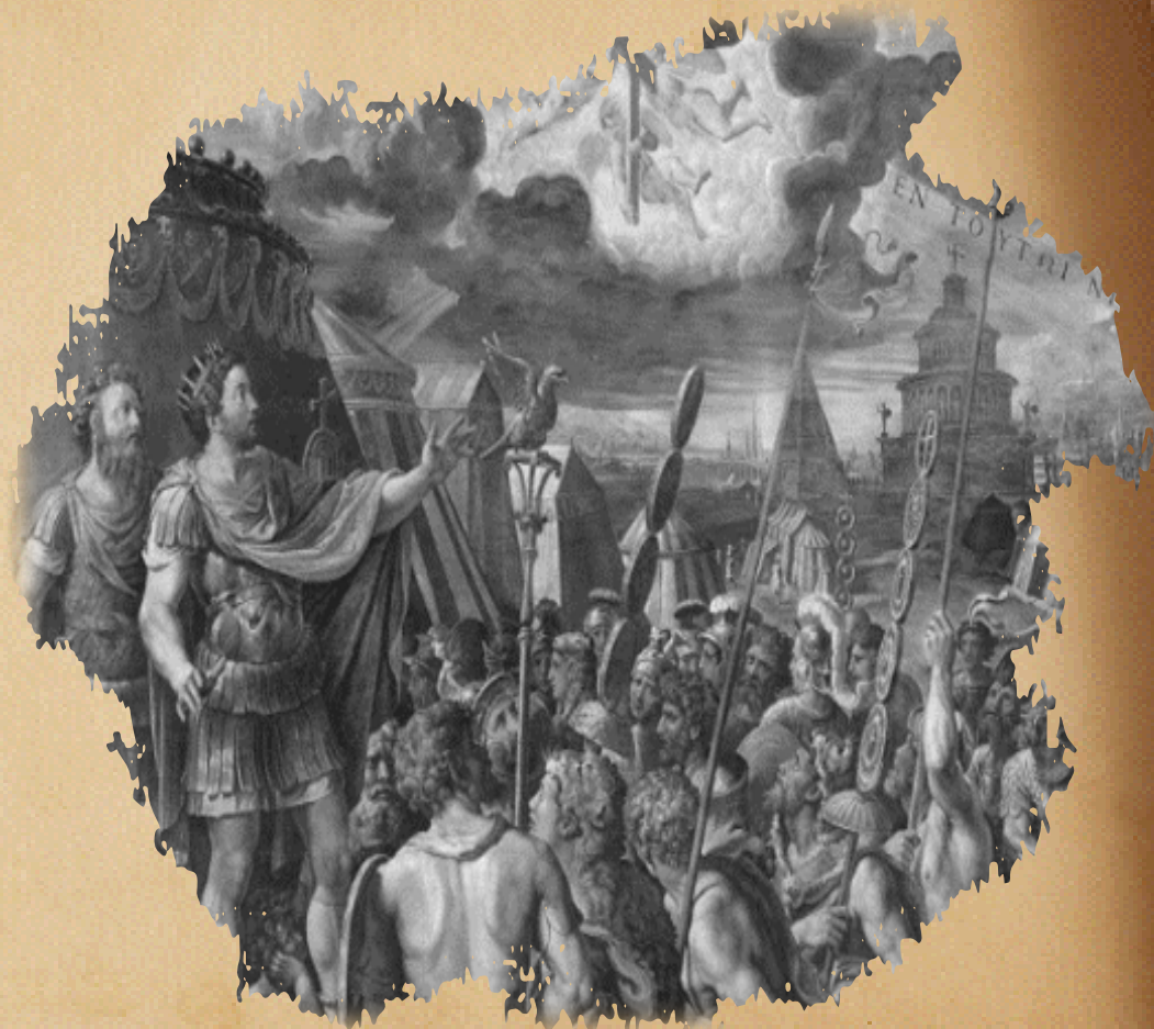
< Emperor Constantine's dream >

Christianity was recognized by Emperor Constantine of Rome in 313 through the Edict of Milan, which granted freedom of religious belief, and was adopted as the state religion in Rome by Emperor Theodosius in 392. With the blessing of the Pope, the Holy Roman Empire was established in 800, and centered on the spirit of Christianity, Western Europe took shape. In Eastern Europe and the Near East, a Christian-centered society also took firm root through the Byzantine Empire. Thereafter, Christianity spread from Europe and the Near East throughout the world as a global religion.