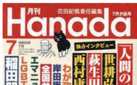
From front page of July 2023 issue of Hanada

Bitter Winter , an online magazine on religious freedom and human rights, published Fukuda’s findings in a series of four articles in English. The first one appeared 23 rd June, the fourth and last 27 th June.