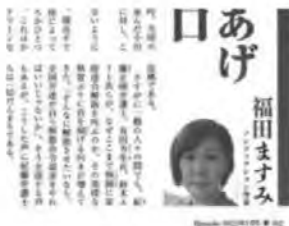
From July 2023 issue of Hanada.

in Japan, the media and the public opinion. For decades, activist lawyers in the network have been using tactics like coercing former members to join their lawsuits against the Unification Church , fabricating evidence, and extorting money from a perfectly legitimate religious movement, that is constantly being persecuted and slandered by those lawyers.