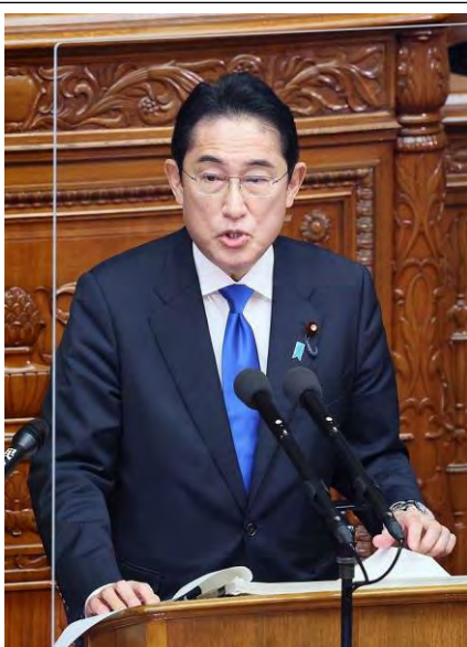
Prime Minister Fumio Kishida being swayed by arguments of hostile lawyers. Japanese Diet 23rd January 2023

(Zenkoku Benren) claims damages of 100 billion yen and argues that "100 billion yen is not enough." However, the actual evidence of harm is almost nonexistent. In reality they cannot go to court because they know they will likely lose if they do.