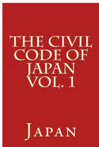
An English exact reproduction of The Civil Code of Japan, vol. 1, 4th edition, first published 1906

When you read the press release from the Ministry of Education, Culture, Sports, Science and Technology regarding the dissolution request, none of these three requirements are mentioned at all. There was no mention of "continuity" at all. There was no mention of the 2009 compliance declaration issued by the Family Federation either. The arguments of the two sides don't mesh.