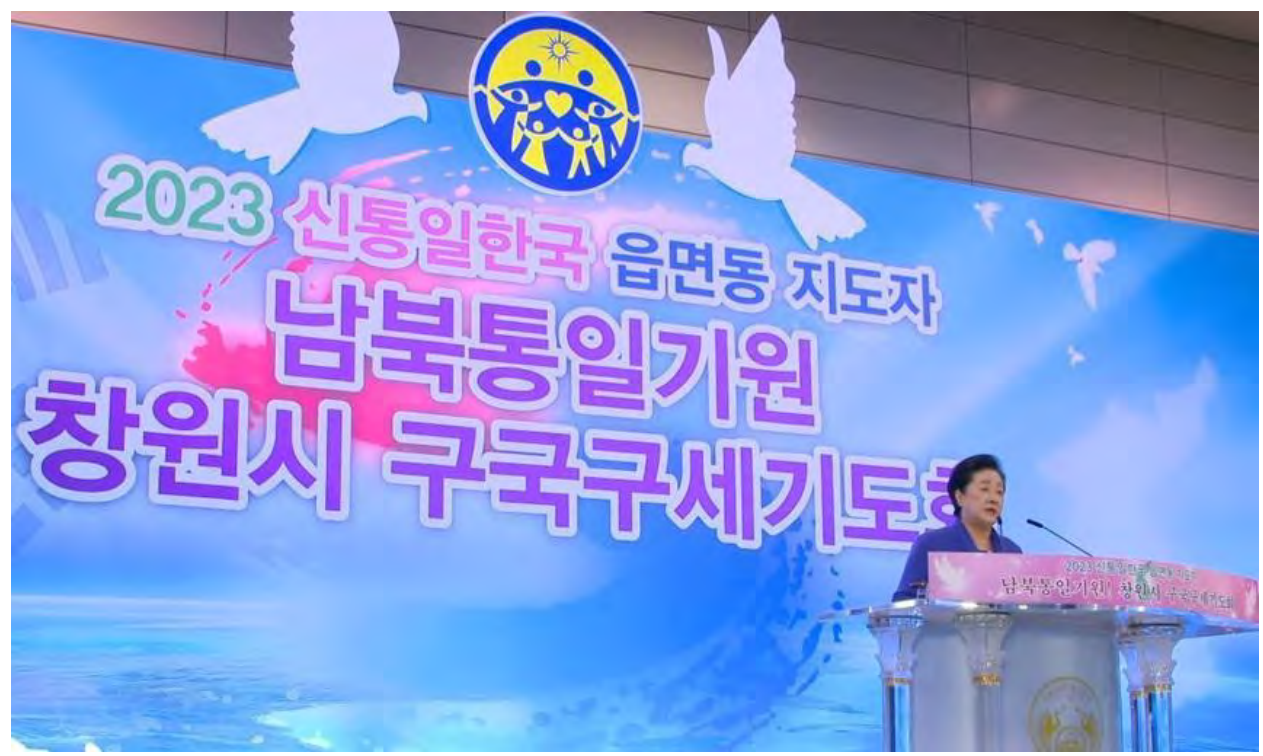
Mother Moon speaking at the prayer rally i Changwon, South Korea 26th Nov. 2023