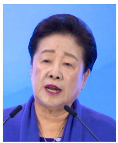
Mother Moon speaking 26th Nov. 2023 in Changwon

worked so hard for 2,000 years. Only then, will we become one with the 'only begotten daughter' (독생녁 in Korean) and rise up. I pray that Christianity and all religions will advance not only in Korea, but also around the world. I therefore pray that all of you gathered here today will demonstrate leadership surpassing that of a hundred or a thousand persons and be victorious without fail."