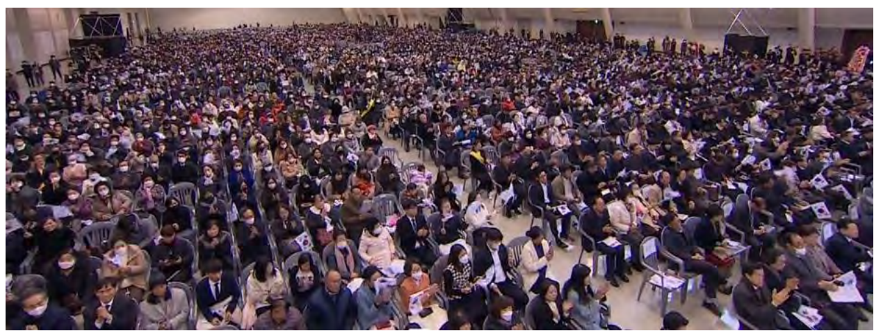
From the prayer rally in Changwon 26th Nov. 2023

Mother Moon visited Changwon (창원) South Korea's 11th largest city with 1,2 million inhabitants, on the south coast, on 26th November 2023 to take part in a "Grand Prayer Rally for the Salvation of the Nation and the World and the Reunification of the Korean Peninsula".