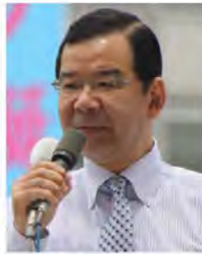
Kazuo Shii. License: CC ASA 3.0 Unp, 2.5 Gen, 2.0 Gen and 1.0 Gen

Speaker Newt Gingrich has pointed out in a Washington Times op-ed that the chairman of the Japanese Communist Party has revealed their plan in an interview. Communist Party chairman Shii said openly that the starting point in the history of this, was an anti-communist organization that was united with the Unification Church . They called this half a century of historical collusion between the two organizations.