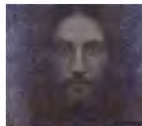
Jesus. License: CC ASA 4.0 Int

The Unification Principles emphasize that God is a fatherly and motherly being, with masculine and feminine aspects. And when God created human beings in his image, He created them as man and woman. Originally, God should have become human through Adam and Eve in the Garden of Eden.