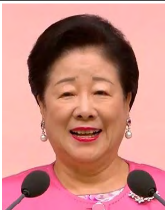
Mother Moon 29th June 2019

Are we ready to take up the challenge that the True Parents have given us to avoid the hooks of the evil one, and instead show by the way we live, and particularly the way we love each other, that we belong to God .