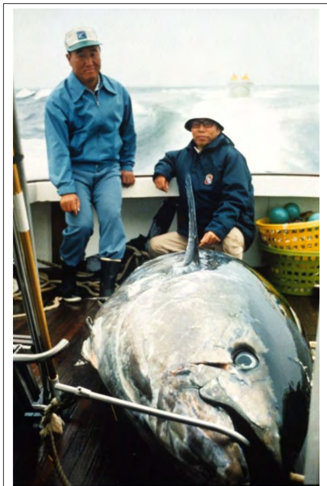
Sun Myung Moon (left) fishing tuna in the Atlantic Ocean

"Why is it so difficult for God to build the Kingdom of Heaven ? Why has God struggled and not succeeded for 6,000 years?"