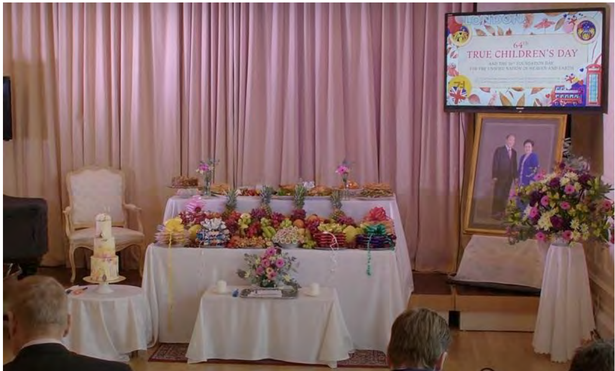
The offering table at the celebration of True Children's Day in the River South community of the Family Federation UK 12th November 2023

I think all of us who are parents, one of the most delightful things is when we see our children loving and caring for each other, and even if they don't do so much for us. Our children all live in California, so we don't hear much or see much of them. But they communicate with each other every day, and it's a beautiful thing. It makes us so happy.