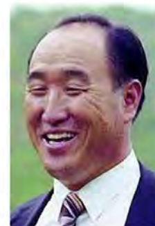
Sun Myung Moon, 1972.

"Why did God need Adam and Eve? He had two purposes: first, to realize the ideal of love, and second, for the invisible God to make Himself visible after taking on a form. For this reason, Adam and Eve are the base and core through which the invisible God can assume a visible form and establish a relationship with the visible world." (From a speech Sun Myung Moon gave 1 st April 1977. Quoted from the English version of the speech collection Cheon Seong Gyeong , 2006-version, p. 95)