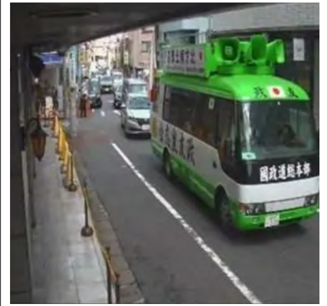
Japanese sound truck of the kind used to drive slowly past <u>Family Federation</u> properties while blasting out hostile message

Due to media reports, a young man who suffered excessive stress attempted suicide, and some actually committed suicide.