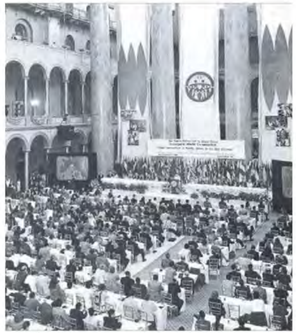
From the Inaugural Convention 31st July 1996.