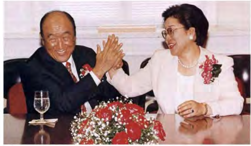
Father and Mother Moon 1st August 1996.