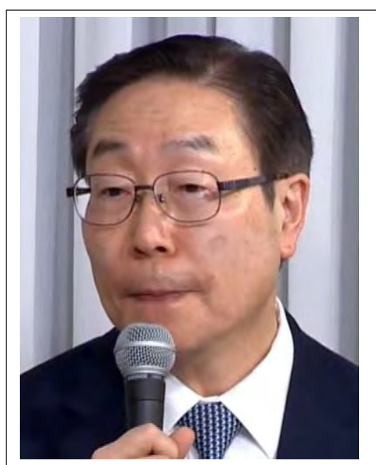
Tomihiro Tanaka at press conference in Tokyo 7th Nov. 2023

At a press conference 7th Nov. 2023 at the national headquarters of the <u>Family Federation</u> in Shibuya, Tokyo, attended by most major Japanese news outlets, the president of the <u>Family Federation</u> of Japan, Tomihiro Tanaka, was asked about the wave of persecution members have experienced since the Abe assassination in July 2022.