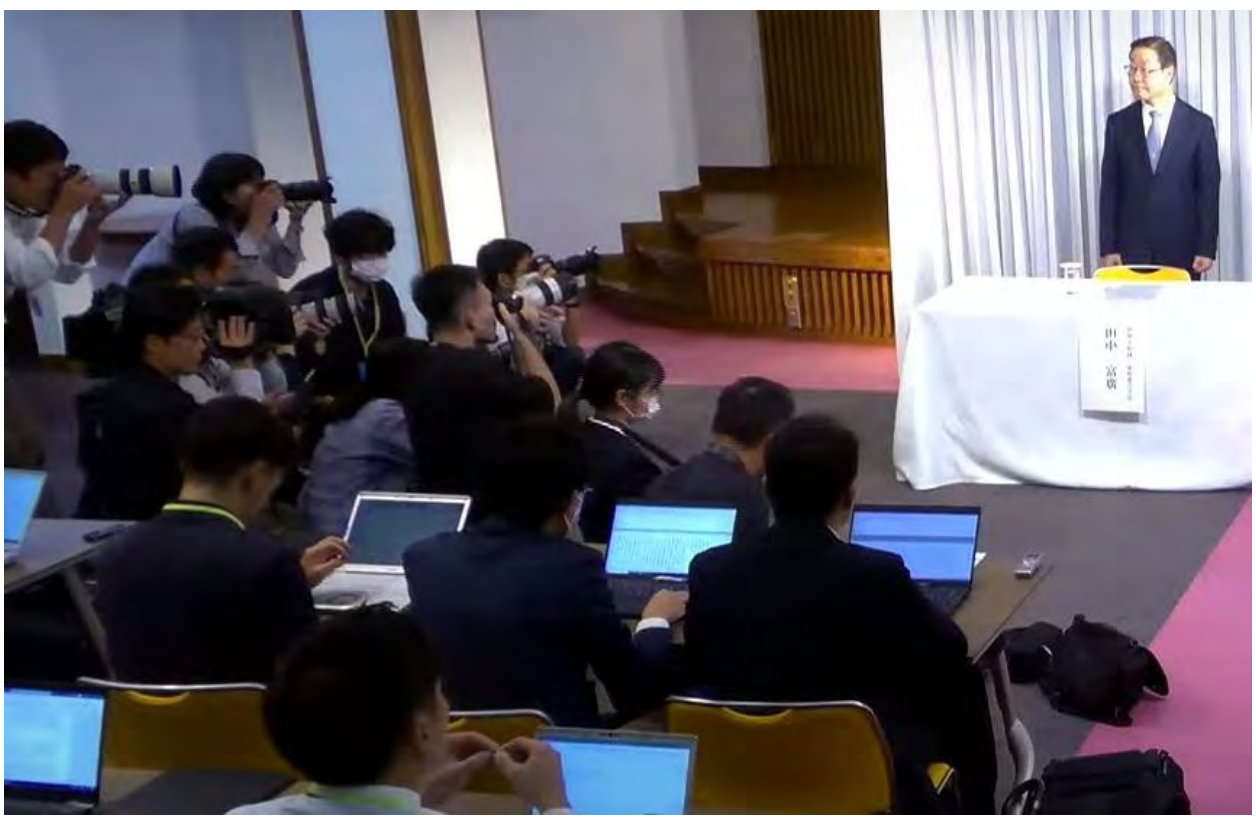
From the press conference i Tokyo 7th Nov. 2023