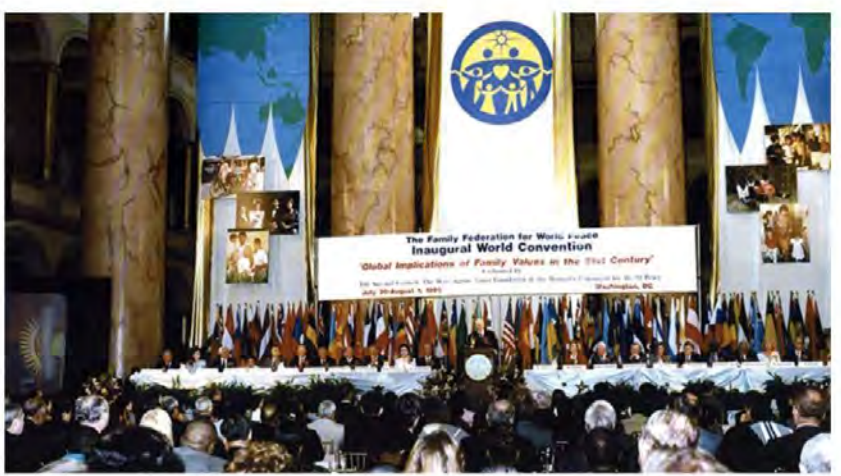
The Inaugural World Convention of the Family Federation 31st July 1996

As co-founder, Mother Moon gave the inaugural address titled "View of the Principle of the Providential History of Salvation", reading a prepared text. Father