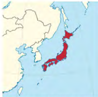
Japan. License: CC ASA 3.0 Unp. Cropped

In Japan, thousands of converts to the Unification Church and about 200 to the movement of Jehovah's Witnesses have during four decades been victims of abduction and attempts of forced deconversion in long-term confinement conditions: weeks, months and sometimes years. The Japanese media outlets always kept silent about these massive violations of human rights but were very prolific in their politically motivated campaigns stigmatizing the Unification Church as a dangerous cult. This is again the case with the current intense campaign against the Unification Church in the Shinzo Abe case.