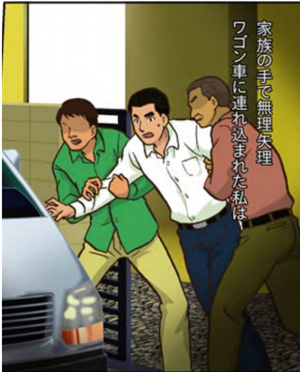
Drawing depicting kidnapping of a member of the Family Federation in Japan