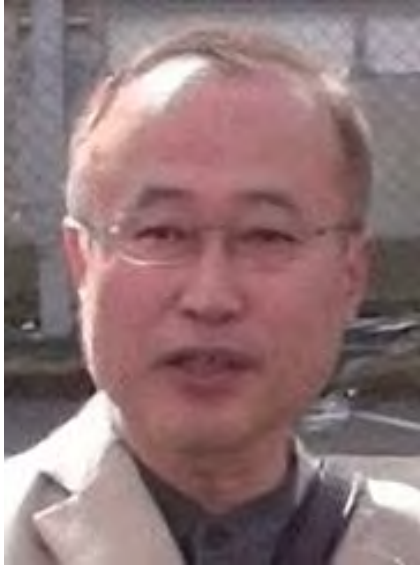
Yoshifu Arita in 2014