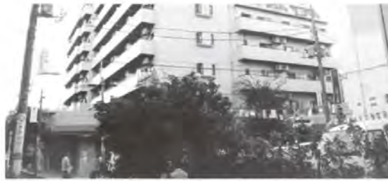
The apartment block in Ogikubo, Tokyo where Hirohisa Koide was forcibly detained in 1992.

apartment in Ogikubo in Tokyo where I was first confined. (Photo shown) It is a very ordinary apartment. I was 29 years old and working at a general hospital in Tokyo.