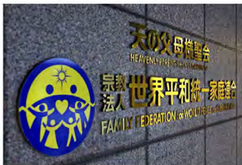
Sign at the entrance of the headquarters of the Family Federation of Japan in Shibuya, Tokyo.

Under Article 715 of the Civil Code, there is almost no way for an employer to escape liability. That’s