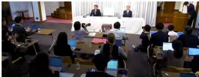
From the press conference at the national headquarters of the Family Federation of Japan in Shibuya, Tokyo 16th October 2023.

Presumably, this is also the basis for the request for a dissolution order filed on the 13 th October. I assume that this is the case.