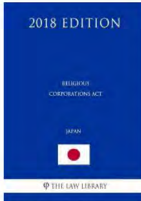
Front page of 2018 English version of Religious Corporations Act of Japan.

The legal issues in both the administrative fine trial and the dissolution order request case overlap.