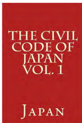
An English exact reproduction of The Civil