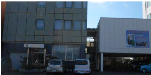
A Family Federation branch in Kashiwa, Chiba, Japan 27th Nov. 2017

In addition, we have also announced a policy to drastically reduce the amount of the budget for overseas missionary support and the amount of money sent overseas.