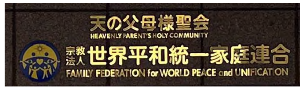
Sign at the entrance of the Family Federation's national HQ in Tokyo

Personally, I am extremely surprised by the stance of public opinion in Japan against our members. Do they know that countless numbers of Japanese citizens moved to every continent of the globe to serve local villages, towns, cities, communities, and churches? These Japanese citizens are all married, raising healthy families, and instilling values that Japanese culture is known for, such as filial piety, respect for elders, and the mindset of public service for the sake of others. I have not met any other group from Japan that has had as much positive influence around the world. Regardless of people's current religious beliefs, I believe that the Japanese people should be proud of the dedicated, selfless work of the Family Federation.