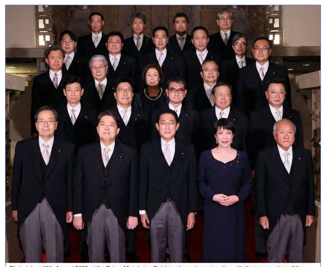
Photo taken 10th August 2022 at the Prime Minister's official residence in conjunction with the inauguration of the second Kishida reshuffled cabinet. Photo: 內閣官房內閣広報室/Wikimedia Commons. License: CC Attr 4.0 Int. Cropped