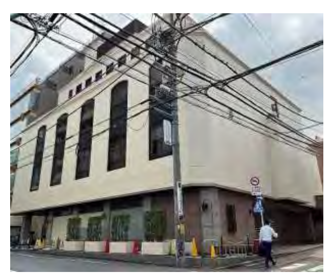
Tokyo headquarters of the Family Federation of Japan