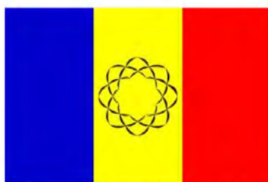
The Soka Gakkai International flag.

attacks on the Unification Church by communists in Japan, or communist-initiated projects like National Network of Lawyers Against Spiritual Sales , the Unification Church , now called the Family Federation , may indeed be the one religion that the communists fear the most.