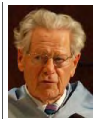
Hans Küng - 1928-2021