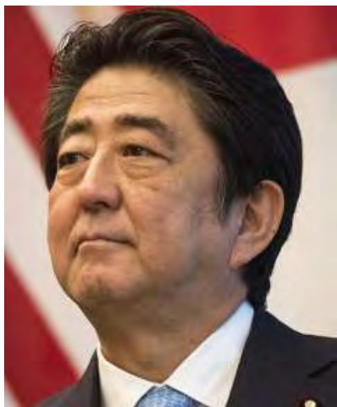
Shinzo Abe in 2017

Misinformation and its source led to the death of former Prime Minister Abe.