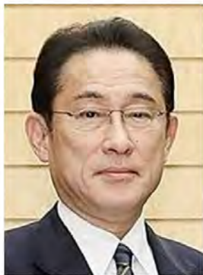
Fumio Kishida, Japanese Prime Minister, in 2020.

Some media in the Western world have also picked up the story.