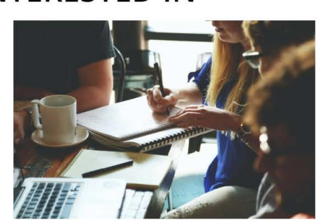
The Imaginations Seminar Returns To Lancaster Gate