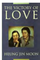
Victory of Love

Kunden, welche diesen Artikel bestellten, haben auch folgende Artikel gekauft: