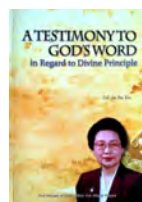
A Testimony to God`s Word - In Regard to Divine